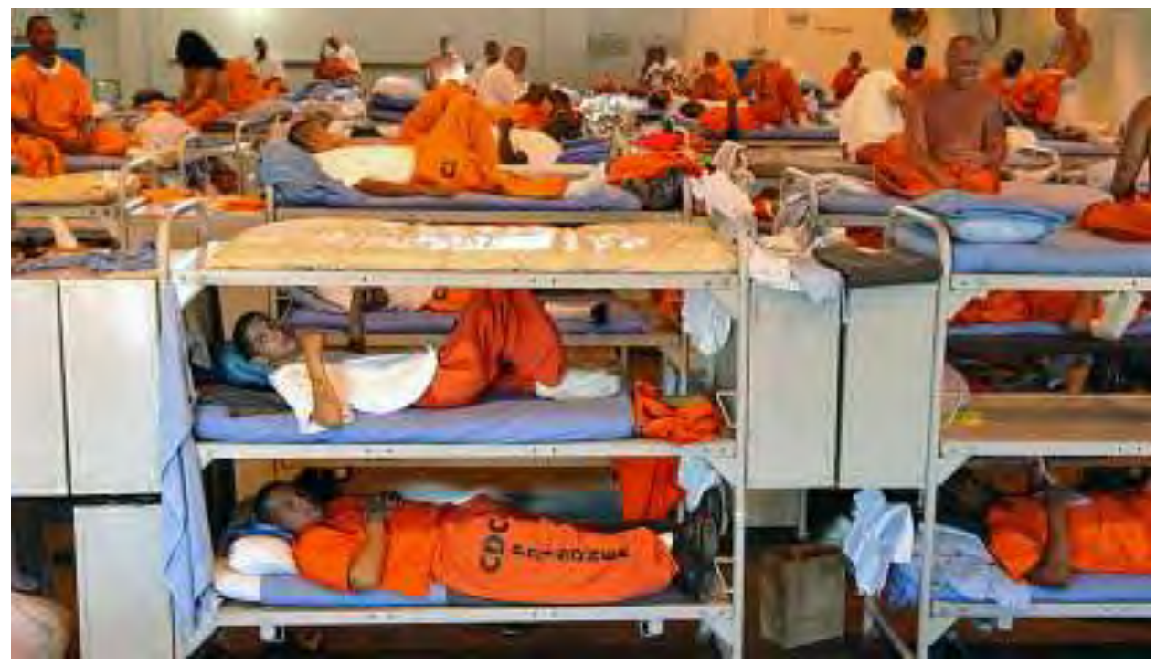
Our jails have become filled with lives destroyed by the atmosphere of violence and disunity which haunts our streets

exists deep in the philosophical core of each and every being on earth. Men's power has been twisted toward methods of external control and physical force, and history has been one of war and conflict.