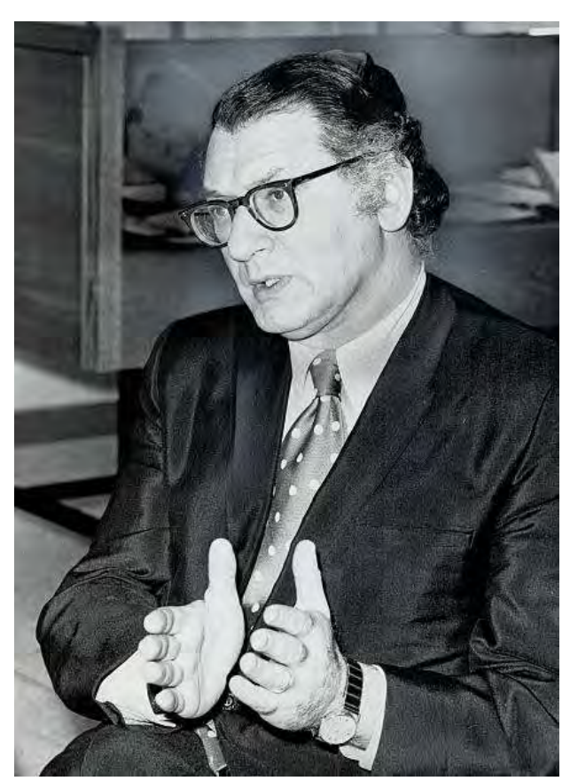
Rabbi Marc Tanenbaum

life is of infinite worth and preciousness; that no human being can be used as an object for someone else's project or program or ideology, or even someone else's revolution.