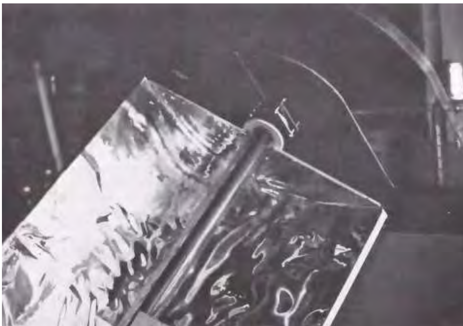
This solar collector produces enough heat to boil water in the coffeepot at rear

Hess listed a number of other sources of energy preferable to petro-chemicals or even atomic energy. Offshore drilling rigs, Hess points out, which many hope will solve the energy crunch, themselves require huge amounts of energy. Nuclear plants are also deficit energy producers, consuming more energy than they produce.