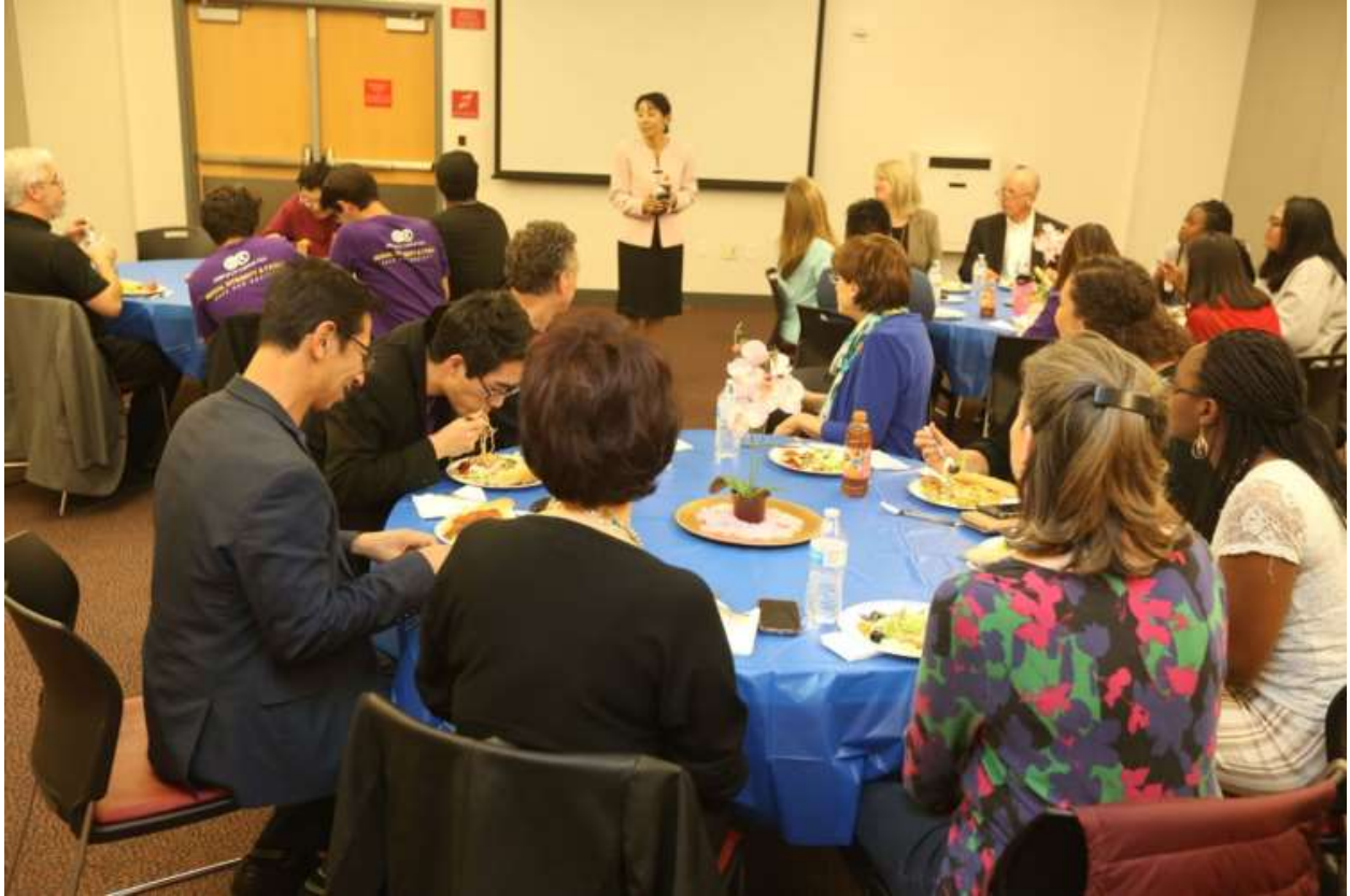
Reception after the Campus Talk

The speakers and the guests representing different organizations were invited to a reception. It was a pleasant meeting, and though most people were meeting for the first time, they felt a sense of bonding. They were also invited to join the advisory committee to plan future Campus Talk events. We all left the dinner with a feeling that we were all at the right place with the right people, and that together we can make something truly wonderful happen.