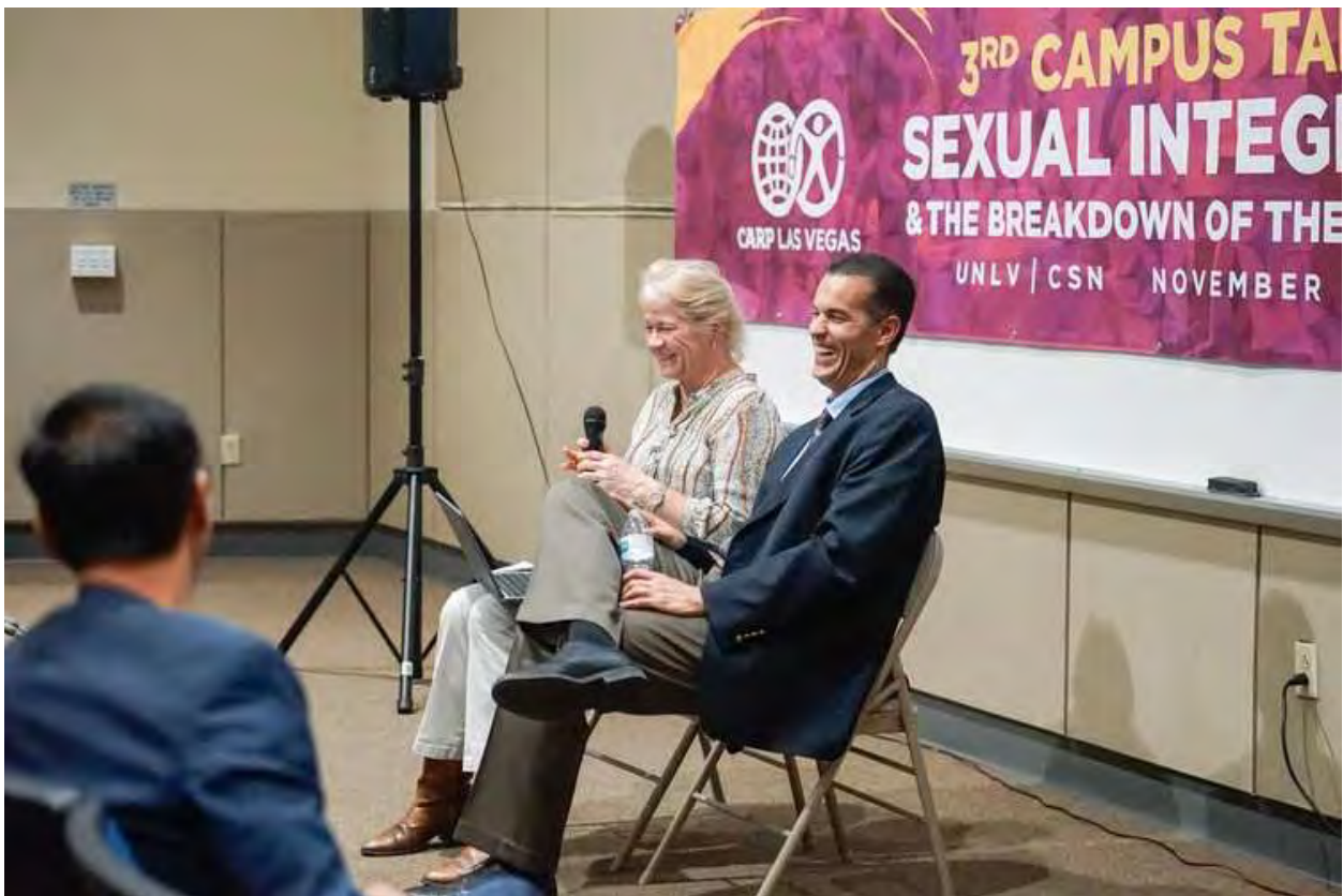
The presenters open up the QandA session.