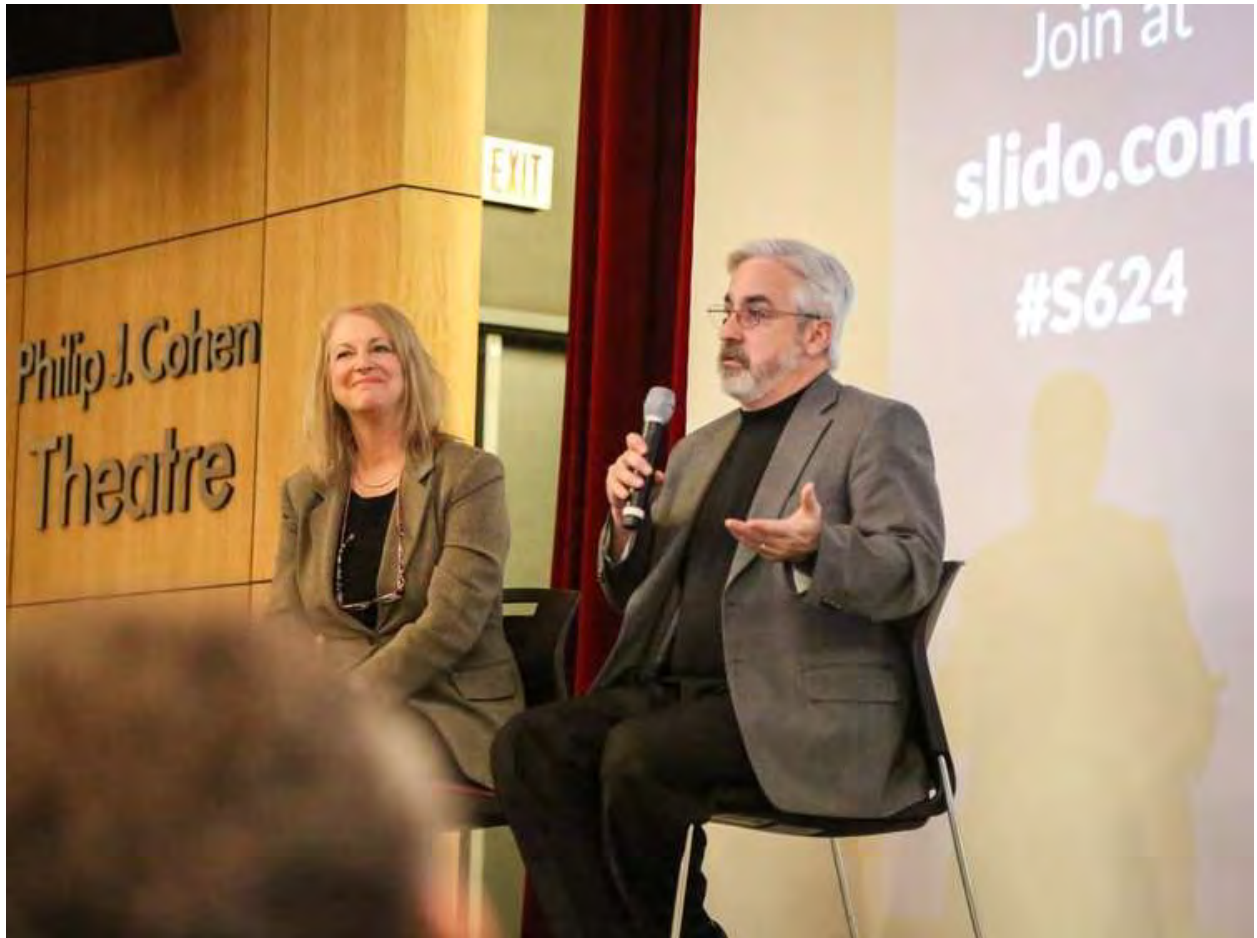
The guest speakers answered questions during the QandA session