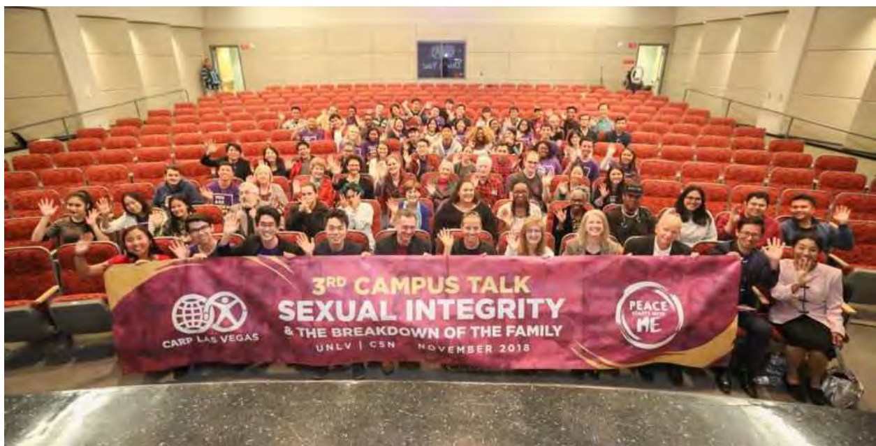
CARP UNLV's Campus Talk followed CSN's