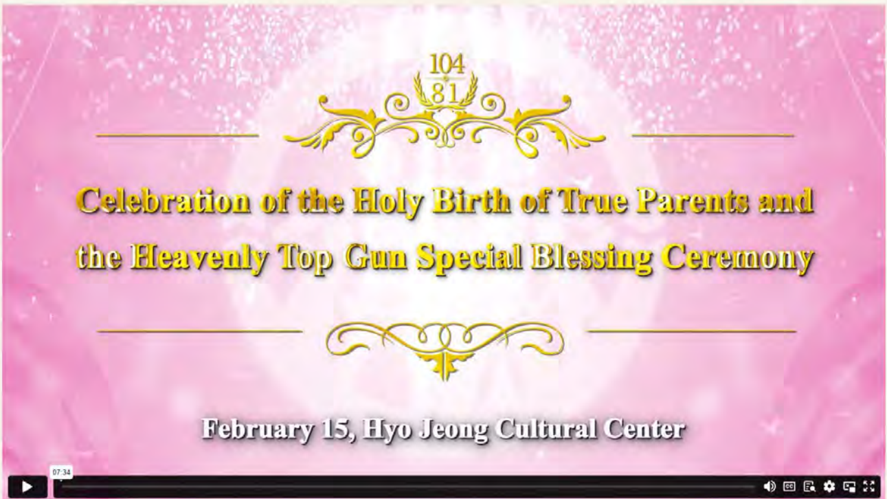
This video is from the February 2024 Heavenly Top Gun Special Blessing.