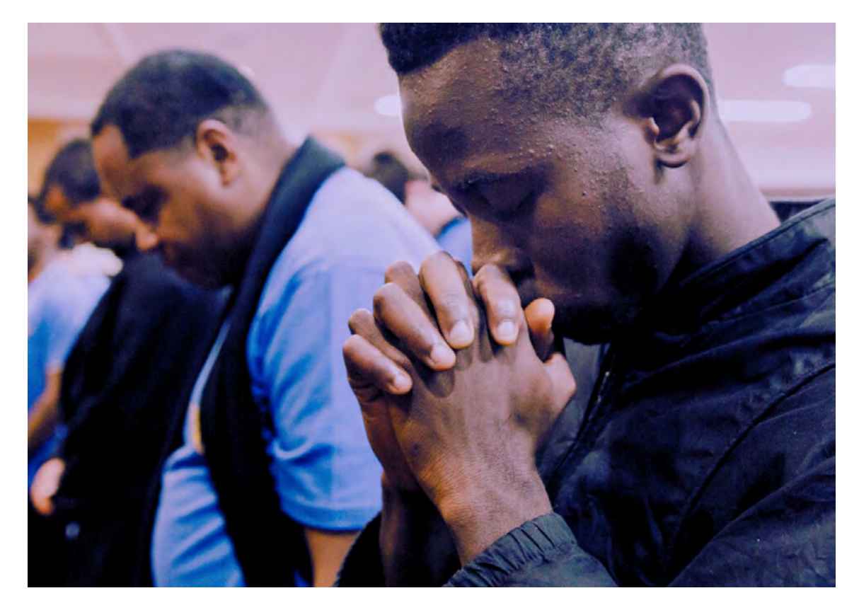
Stay connected by tuning into one of our livestreamed Sunday Services across the nation!