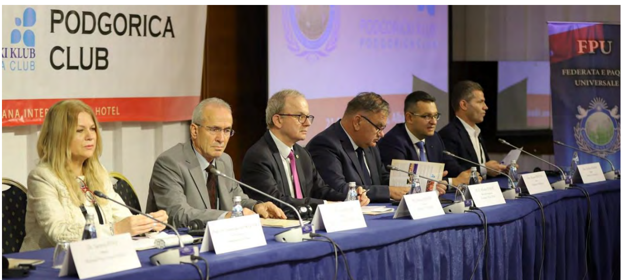
The panelists of the second session