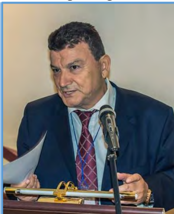
Hon. Gaqo Apostoli