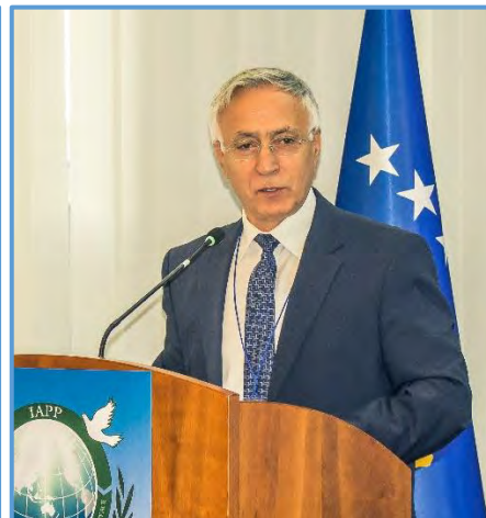
Hon. Jakup Krasniqi

Hon. Jakup Krasniqi, former President of the Assembly and Acting President of Kosovo, spoke of the destiny of his country as a member of the European Union, and called on parliamentarians to develop a new spirit and establish new partnerships. Hon. Talat Xhaferi, the current Speaker of the Macedonian Parliament, who had just arrived from the Macedonian capital, expressed optimism for the new political era in his country, spoke of the need to focus on the UN’s Sustainable Development Goals, and underlined the importance of bilateral and multilateral parliamentary diplomacy to tackle challenges and not repeat mistakes of the past.