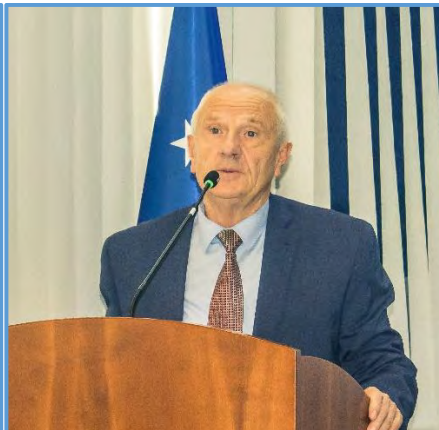
H. T. Fatmir Sejdiu