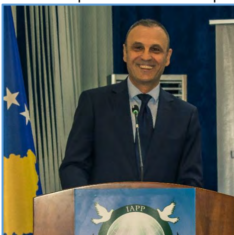
Hon. Slobodan Petrović

Prof. Anto Domazet, a former Minister of Finance and Member of Parliament of Bosnia and Herzegovina, gave an overview of the current economic and political factors for regional cooperation among Balkan nations. Describing the constraints limiting their economic development, he concluded on the challenge of adopting a market system without increasing inequalities. Hon. Slobodan Petrović, a recently re-elected parliamentarian and former Vice President of the Assembly of Kosovo - the only one among 10 Serbian minority parliamentarians to willingly cooperate with the Kosovo government - emphasized the need for integrity in this difficult political climate, and for reconciliation between the Albanian and Serbian communities and other minorities in Kosovo.