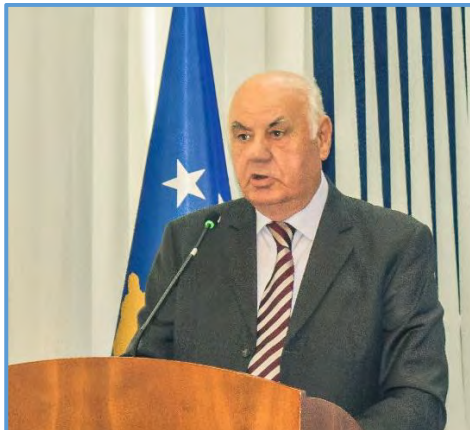
H. T. Alfred Moisiu

President Fatmir Sejdiu of Kosovo said that considering the real value of Kosovo's cultural heritage is the way to foster cooperation and sustainable peace in the region – that he'd rather see culture in politics than politics without culture. President Mesic, who was the last president of the Republic of Yugoslavia and served two terms as president of Croatia, shared with the wisdom of experience that security and stability in Europe will not come through guns and armies, but through the equal treatment of nations, dialogue and communication, and non-interference in internal matters.