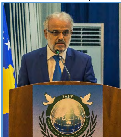
Hon. Talat Xhaferi

Hon. Jakup Krasniqi, former President of the Assembly and Acting President of Kosovo, spoke of the destiny of his country as a member of the European Union, and called on parliamentarians to develop a new spirit and establish new partnerships. Hon. Talat Xhaferi, the current Speaker of the Macedonian Parliament, who had just arrived from the Macedonian capital, expressed optimism for the new political era in his country, spoke of the need to focus on the UN’s Sustainable Development Goals, and underlined the importance of bilateral and multilateral parliamentary diplomacy to tackle challenges and not repeat mistakes of the past.