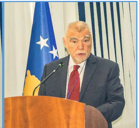
H. T. Stjepan Mesić