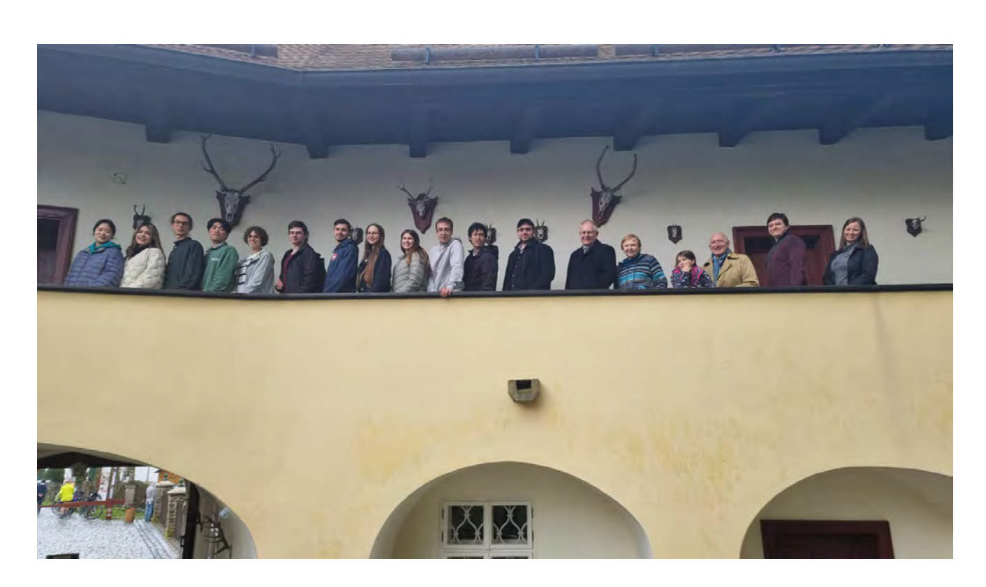
Youth TOP participants standing at the exact same spot on 23rd April 2023.

- The difference between second and third photo is 50 years -