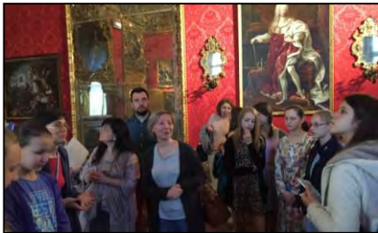
Masterpieces from Ermitage