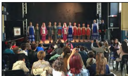
The Angels' performance