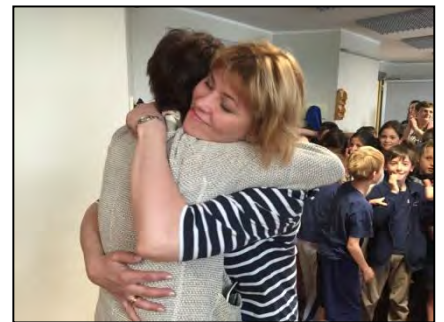
The three bridges of peace

In the distant past, Italy and Russia were on opposite sides ... The Angels of Peace, with their pure heart and beautiful children who think and see only Peace, helped build a beautiful bridge of peace between our nations. Thank you, Angels, you have left a deep imprint in our hearts.