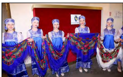
The Angels in Sala delle Colonne

Among the different services the Municipality of Turin offered was a walking tour of the city including a visit to the National Cinema Museum and the Mole Antonelliana. In addition there was a tour of the National Automobile Museum: here the group had fun taking photos near the carriages, the prestigious Italian cars of