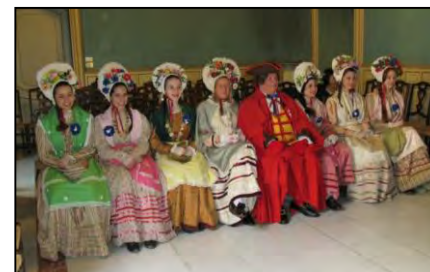
Gianduja, Giacometta and the Giacomette