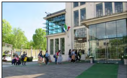
The arrival at the theatre

association was founded in 1925 in this beautiful historical building where we organized an artistic bridge of peace between the Angels and the Giacomette, the folk group of girls dressed with the typical costumes of the florist ladies of 18th century. The Giacomette performed for the Angels the traditional “Monferrina” At the end of the show the Famija Turinèisa offered everybody the typical “Merenda Sinoira”.