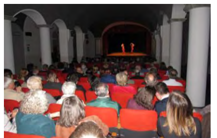
The show from the audience