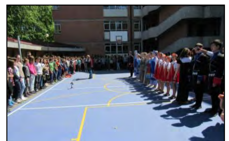
Singing the Italian Anthem together