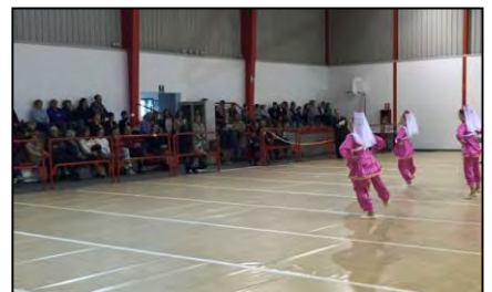
In front of Bruzolo's audience