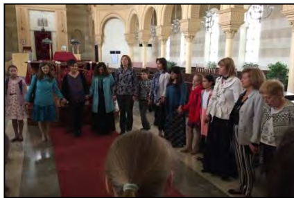
Prayer in the Synagogue