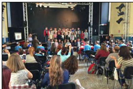
Welcoming the Angels of Peace