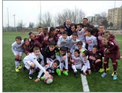
The Peace Dreamers with the children of Torino FC

were trained players in the club. The rain was pouring however it didn't prevent them from conducting friendly games throughout the morning.