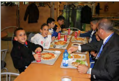
The Cafeteria at the UN Campus

The first challenges over the weekend were not on the field but rather dealing with the complexity of providing both Kosher and Halal food as well as keeping the Shabbat... The goodwill and the benevolence of the Italian hosts were the key for overcoming those obstacles.