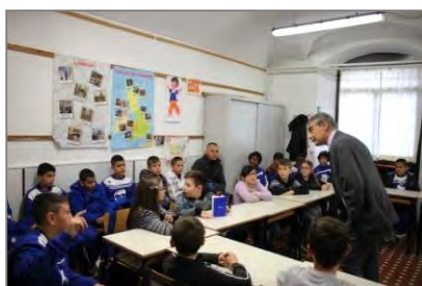
With the director of the primary school