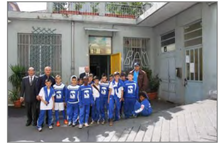
In the Mosque

Next was a visit to the Moslem community, which numbers around 50,000 people in Turin. At the Mosque, the Imam gave the group an orientation and the kids were treated with traditional Arabic sweets.