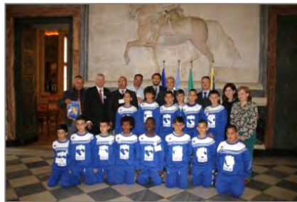
In the Municipality building