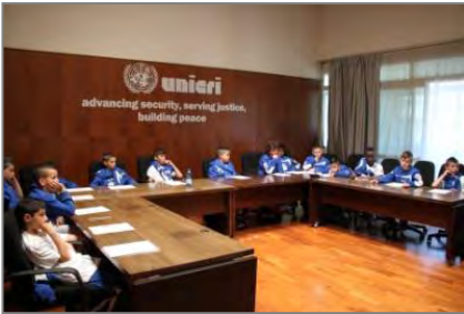
The Peace Dreamers hosted by UNICRI