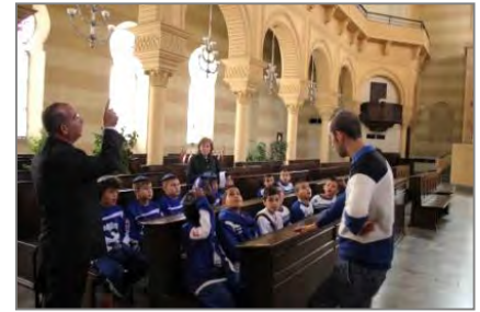
Turin Synagogue – Main Temple

Right after, we visited the Jewish highly secure area. The community embraced the kids on short notice, providing lunch which was followed by a spontaneous soccer game with almost the entire school... The visit concluded with going through the impressive synagogue that serves as a miniature museum for Jewish history.