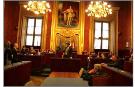
The Hall of the City Council

This experience gave all of us the opportunity to understand cultural differences better and the preciousness of our essence as human beings caring for our brothers and sisters around the world as part of the same big family under God, following the example of our Beloved True Parents.