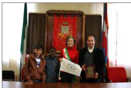
With the Mayor Chiara Borgis