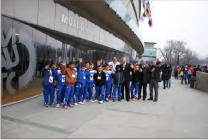
National Museum of Automobiles

On the first day the team visited the famous automobile National museum that was quite fascinating for the boys, who experienced their first trip outside the country.