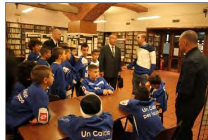
The Jewish library

Without knowing anybody I was able to fix a meeting with the local director of the Union of the Islamic Communities in Italy just half an hour before meeting with the Jewish Community, whose board of directors changed recently. And it was amazing how we were received and taken care of.