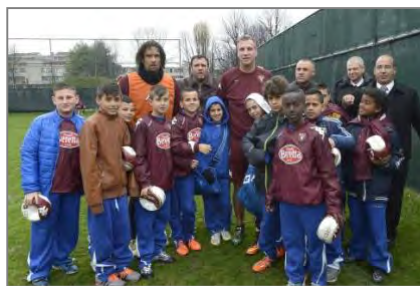
With the players Amauri and Maxi Lopez

The 6th and last day of the visit, provided yet another highlight. The kids were treated to an exclusive peek at the training session of the famous players of Torino FC. They even managed to get a few photos together.