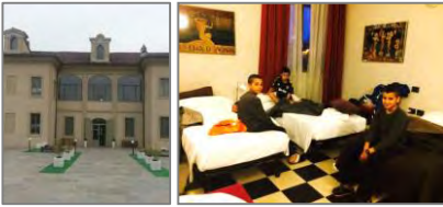
Cascina La Marchesa

On the first day the team visited the famous automobile National museum that was quite fascinating for the boys, who experienced their first trip outside the country.