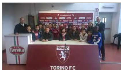
Visiting the Olympic Stadium, in the press room

Next was a visit to the sport museum at the Olympic stadium, followed by a special soccer tournament organized by the youth department of Torino FC, named CIT TURIN.