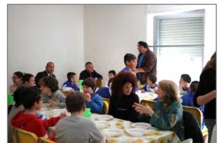
Lunch with Jewish- Italian children

In the late afternoon the team had the opportunity of playing with the children of another local reality “ Antico Borgoretto ” for the “ Palio dei Quartieri ”. The families of the children in Borgoretto prepared a wonderful welcome and cakes and salads especially for the Peace Dreamers. The parents in this area are aware of the fact that a good relationship among children, families and teachers/coaches makes a difference in the education of the future protagonists of our society.