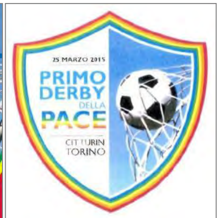
The poster - The invitation at the press conference - The poster for the derby