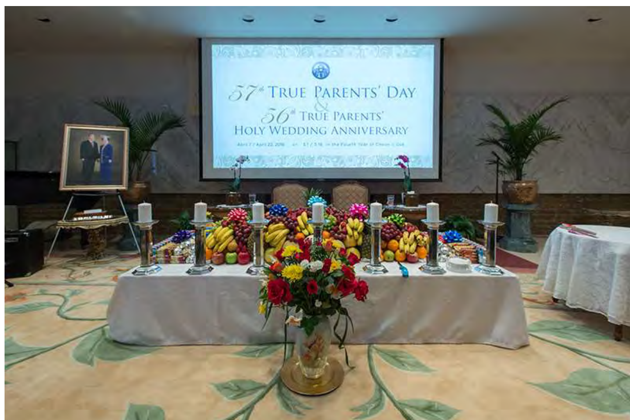
The offering table at East Garden

East Garden is a place close to True Parents' heart, especially during their ministry in America, which took root over 40 years ago. A highlight of the Holy Day ceremony was a series of readings and messages in preparation for this year's 40th anniversary celebrations of the groundbreaking Yankee Stadium Rally (June 1) and Washington Monument Rally (September 18) of 1976.