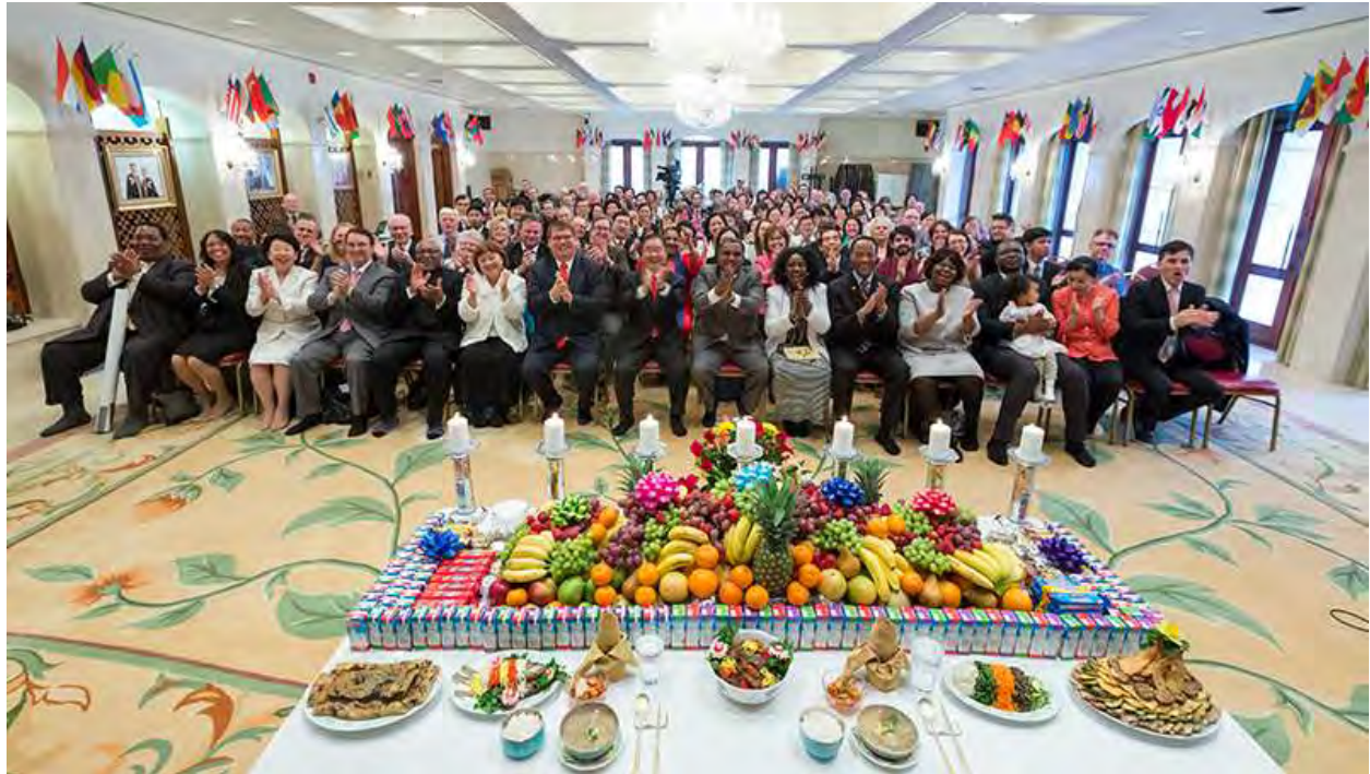
Over 100 people celebrated the Holy Days at East Garden

As we move forward in these critical years for God's Providence, we unite under True Parents' and Heavenly Parent's love and vision for peace. Holy Days are a great opportunity to regroup centered on True Parents' teachings and historical foundation, so that we can move forward their momentum, determination and spirit.