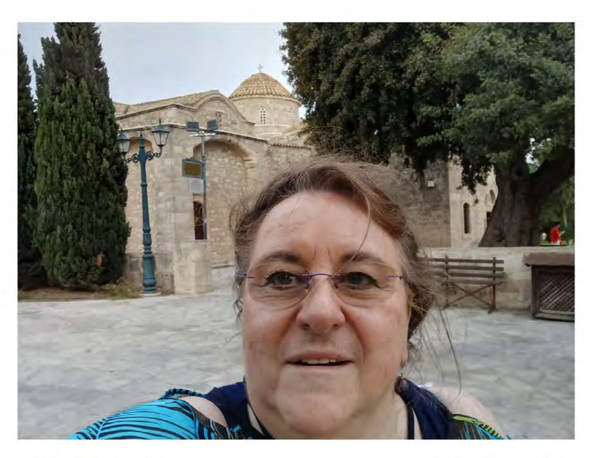
November 27, 2023 in Blog