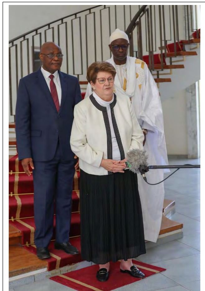
Addressing Senegalese National TV and Radio [broadcast to all French-speaking Africa]

President Macky Sall watched True Mother intensely the entire time she was speaking and at the end of this holy speech given by True Mother, the President said, "Mother, thank you so much for this amazing content. I believe with all my heart that working together for peace can only be achieved when God is at the center and this afternoon, you brought God directly in the middle between you and me and my nation. We shall always work together centering on Heaven!"