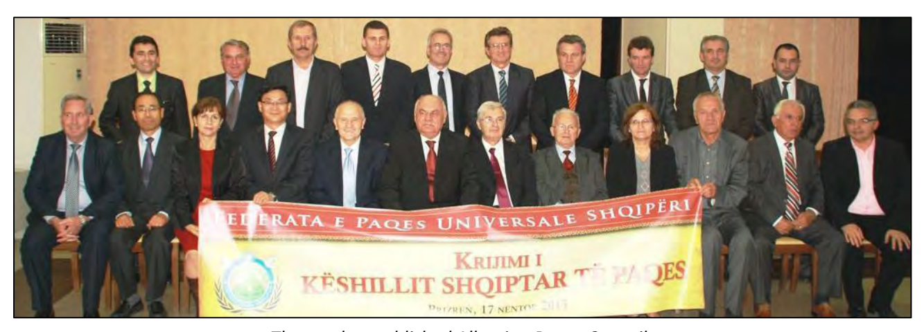
The newly established Albanian Peace Council

Hotel Theranda, Prizren, 17. November 2013