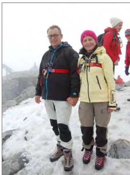
The only blessed couple

Crossing the glacier was the most contemplative part of the climb. After this, our path became steeper and steeper, crossing hills with large, challenging rocks and finally a steep area of heavy snow that drained the last energy from most of us.