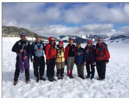
Some of the participants

Reaching the top was a true relief. After eating our lunch packs we needed to start our program even though one participant was still lacking. Even our guide was sure he would not make it to the top. However, when we started to gather, a shadow appeared in the fog and there he was, our 21st participant. He later said he had never been so exhausted but at the same time he would never be without this experience.