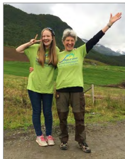
The oldest participant was 72 years old and the youngest 17 years.

The evening ended with a nice celebration dinner at the base camp with reflections and many songs. One guest expressed how proud he was to take part in this project for peace. For all of us this event was really tiring for the body, but very reviving for the spirit. We do not think we could have brought the PEACE ROAD higher than this. Aju!