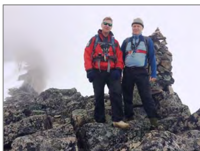
200 metres from the summit ...

Others in the line seemed to be inspired by holy songs too, as I heard someone in the front start to sing «Grace of the Holy Garden.»