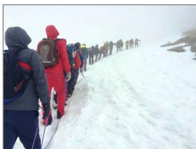
Crossing the glacier

There were 21 participants between the ages of 17 to 72 years old, including 10 second generation. We set out on the 4 hour climb together with a professional guide. At one stage we crossed a glacier, walking in a line, connected with a rope. This one hour crossing inspired to contemplation and the theme from one of our holy songs kept coming to my mind; «Now I behold Jerusalem, City of loveliness, gently descending from above ever to be my own» As I was climbing up, Jerusalem was coming down. For me it made sense. As we make efforts, God comes to us.