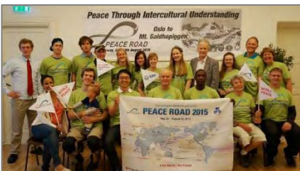
Participants at the Launching ceremony

The theme of the Norwegian PEACE ROAD was «Peace Through Intercultural Understanding», a relevant theme in our society where the government encourage all kinds of dialogue projects. Representatives from 4 continents and 7 nations participated at the launch on Thursday 6th August.