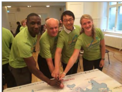
Participants from 4 continents sign the Peace Road banner

Our chosen activity in the PEACE ROAD was to travel by car from Oslo to the foot of the tallest mountain in Norway and from there to climb the mountain peak, Galdhøpiggen which is 2469 meters high. We wanted to bring the PEACE ROAD and our desire for peace from the launch in Oslo to this peak as a pilgrimage. And from the very top we wanted to express this desire to heaven. Symbolically speaking, you cannot get closer to heaven than that.