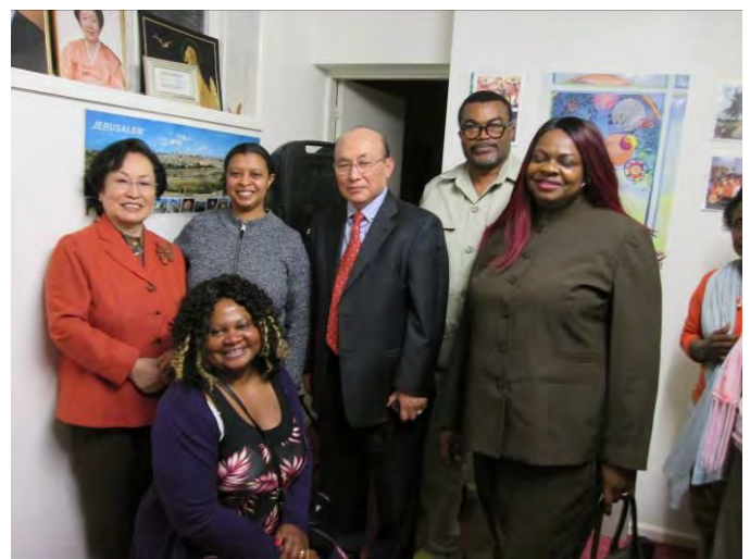
Taking a photograph with four of our newer members.

All in all, we could achieve quite a lot during a relatively short time, and we said goodbye to our emissaries with a happy heart the next morning, as they continued on their journey around the UK, flying north to their next stop in Edinburgh.