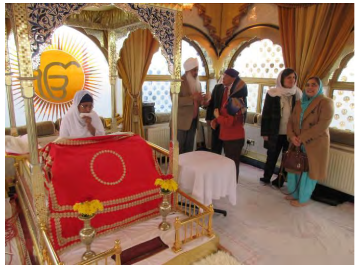
Inside the 'holy of holies'.

The main dome on top of the gurudwara is rather like the 'holy of holies', where the Guru Granth Sahib is read continuously, and prayers offered for the whole world. The ceiling of this place, and the interior of the dome is a breathtaking sight to behold. It comprises around 120,000 pieces of cut glass, stunning in colour, beauty and form, but perhaps the most remarkable fact is that it was created and 'built' by a Muslim artisan, a specialist in cut glass. Given the fractured history between Sikhs and Muslims, this is absolutely amazing.