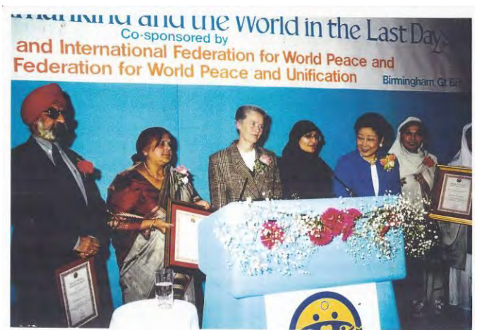
Presenting Ambassador for Peace awards.