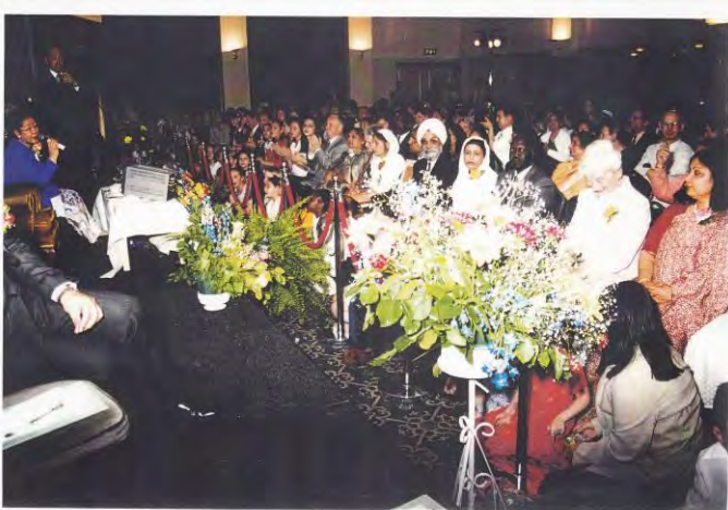
True Mother speaking in Birmingham. May 2000.

All in all, we could achieve quite a lot during a relatively short time, and we said goodbye to our emissaries with a happy heart the next morning, as they continued on their journey around the UK, flying north to their next stop in Edinburgh.