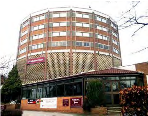
The uniquely shaped Strathallen Hotel