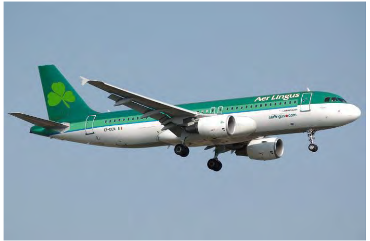
The Aer Lingus flight from Dublin