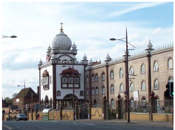
The main Sikh gurdwara on Birmingham's Soho Road