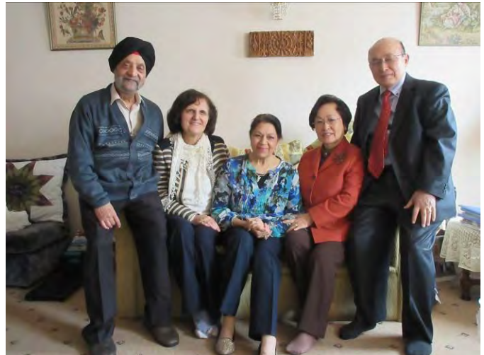
Both couples are 'Special Emissaries'!