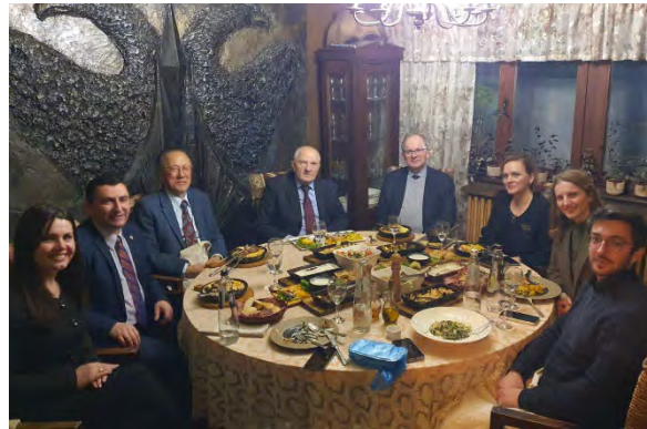
Dinner meeting with former Kosovo President Fatmir Sejdiu, Feb. 11