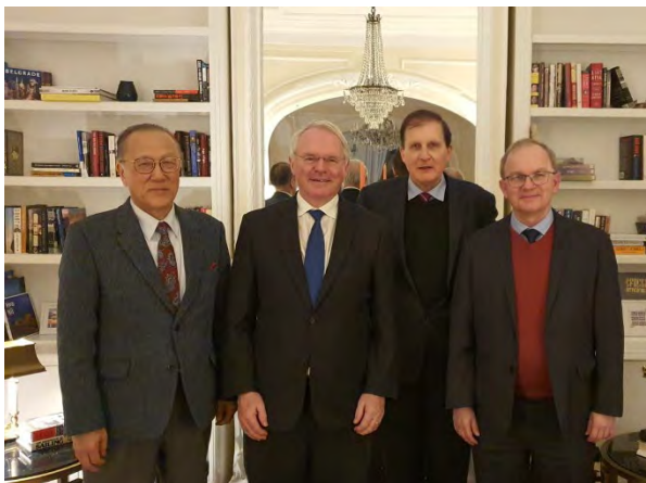
With US Ambassador Christopher Hill at the US Embassy Residence in Belgrade, Serbia – Feb. 9

On January 10 th we were invited to lunch by former Serbian President Boris Tadic, who had attended the Summit-ILC last August in Korea. President Tadic expressed his desire to cooperate with UPF on “peace and reconciliation in the Balkans”. We had a long discussion with him, he explained with an open mind the Serbian viewpoint on Kosovo, and we expect to continue deepening this connection with him. We also had the opportunity to meet with some of the main Peace Ambassadors from Serbia, who have been attending UPF meetings over the last few years. They expressed their interest in UPF activities, and suggested ways in which we could work together.