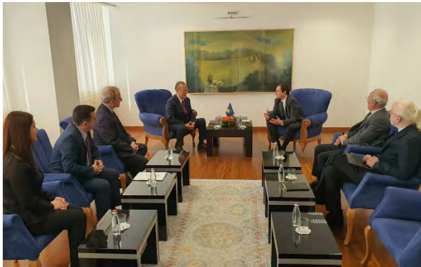
Meeting with Prime Minister Albin Kurti Pristina, Kosovo, Feb. 11