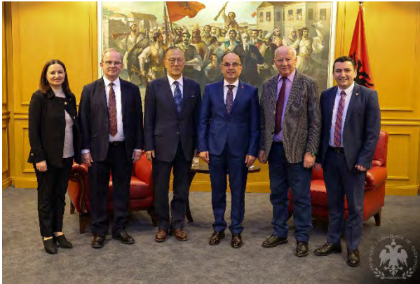
With President Begaj of Albania Tirana – Feb. 14

Our trip is continuing with an upcoming Forum in Berlin. More later.