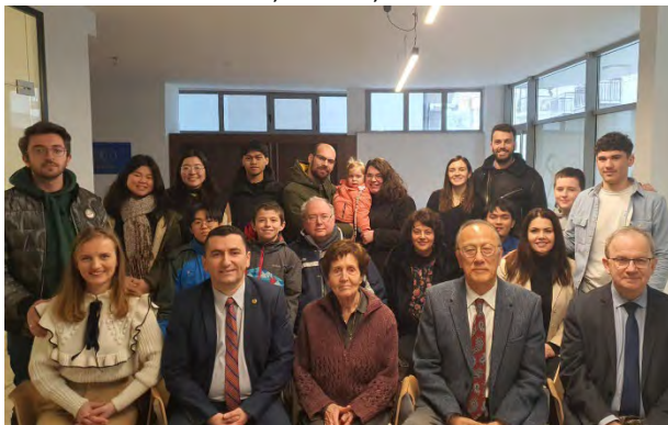
Sunday Service with Kosovo members Feb. 12