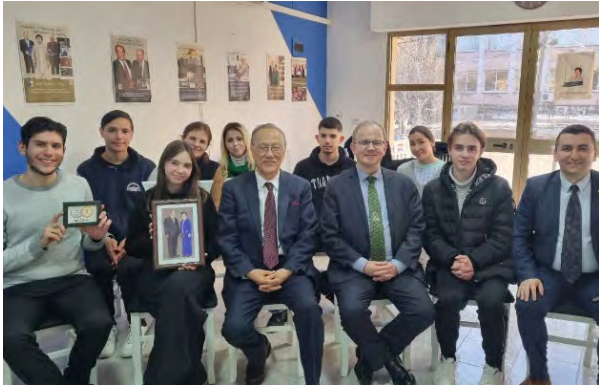
Meeting with members at the Shkodra Center Feb. 13