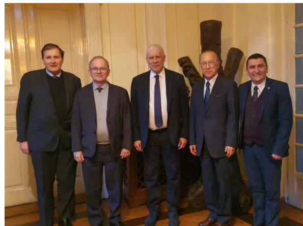
With former Serbian President Boris Tadic Belgrade, Feb. 10