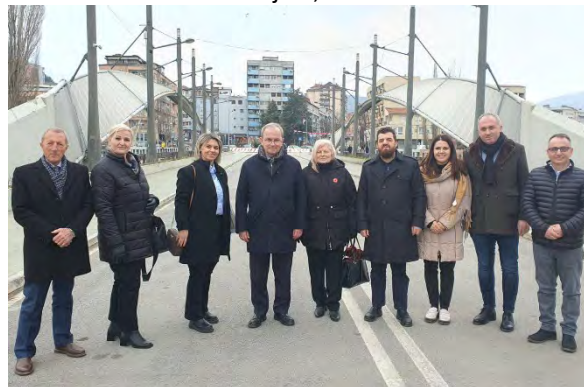
On the bridge marking the division between Serb and Kosovar communities in Mitrovica - with Peace Ambassadors (including the main imam) Feb 12