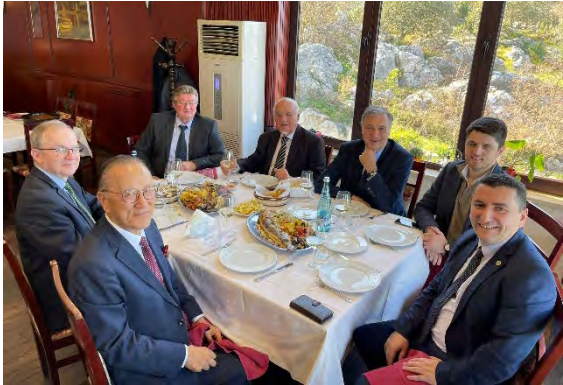
Lunch meeting with President Moisiu (Albania) and President Vujanovic (Montenegro) in Shkodra, Albania – Feb. 13

On June 14 th , we had an unexpected call from Albanian President Begaj, who wanted to know more about the upcoming Summit in Korea. We were received very officially at the presidency, as UPF is a very respected organization in Albania, due to the testimony of high-level Peace Ambassadors working in official positions in the country.