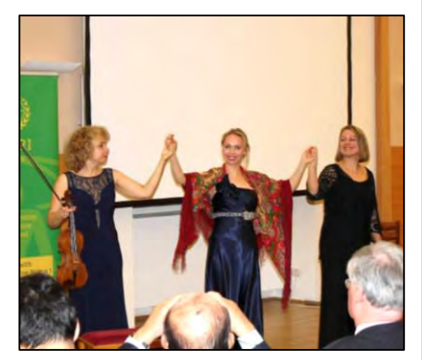
Before the afternoon session, a beautiful and moving musical performance by three artists from Kiev, Donetsk and St. Petersburg—three regions in bitter conflict in Eurasia enchanted the audience with traditional songs from Ukraine and Russia accompanied on violin and piano.