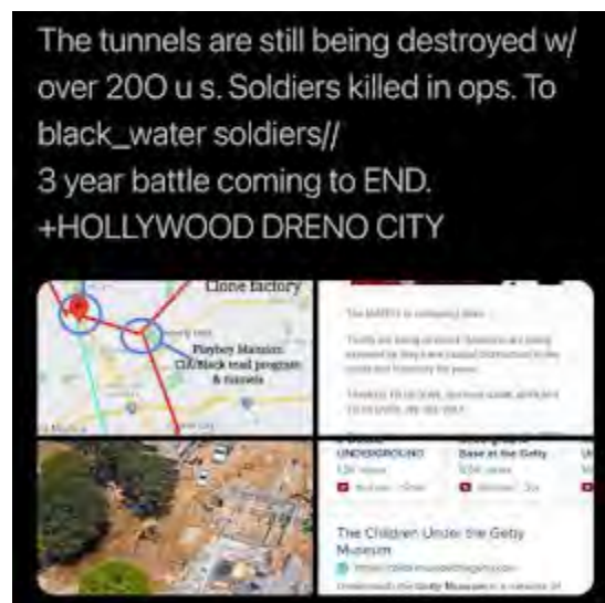
3 year battle coming to END

When God asked me to open my spiritual senses for 100 days so that I can see the situation by myself, I resisted. But He said, "There is no other way to show you." Each evening, when satanists gathered and chanted, doing their evil rituals, I could feel the evil energy coming and the multitudes of evil spirits coming and trying to invade my body. These low vibrations of horror and fear keep humanity in resonance where their hearts cannot open and they are vulnerable to evil spirit world influence. I remember, when Rev. Moon found out of this, wishing he never did. I felt the same way. But no matter how painful the truth, God needs us to liberate him and his children.