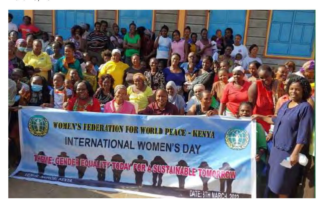
On March 8, 2022, Women's Federation for World Peace (WFWP) Africa joined the International Community in celebration of International Women's Day. This year's theme is "Gender Equality Today for a Sustainable Tomorrow." We held a virtual program, and in addition, the various WFWP chapters in the Africa region also held in-person celebrations.