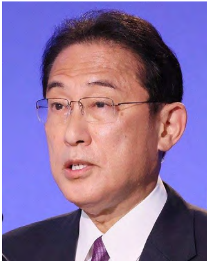
Prime Minister Fumio Kishida delivering a speech at the COP26 in November 2021

On 5th October last year, when it seemed certain that an order to dissolve the Family Federation would be issued hastily, the National Network of Lawyers Against Spiritual Sales made a serious correction to the number "34,537 cases, total damage amount of 123,733,575,406 yen", which had been displayed as the total of the separate damage tally since 1987.