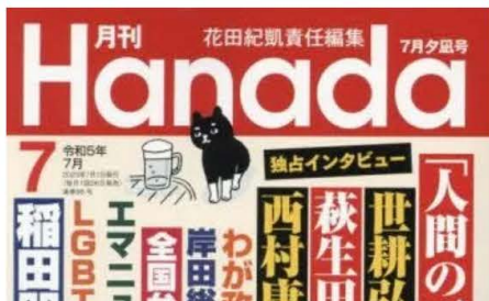
From front page of July 2023 issue of Hanada

Bitter Winter , an online magazine on religious freedom and human rights, published Fukuda's findings in a series of four articles in English. The first one appeared 23 rd June, the fourth and last 27 th June.