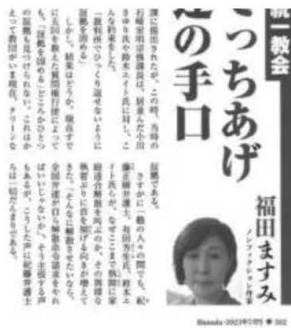
From July 2023 issue of Hanada.

Monthly Hanada, an extreme network of leftwing lawyers manipulating the legal system in Japan, the media and the public opinion. For decades, activist lawyers in the network have been using tactics like coercing former members to join their lawsuits against the Unification Church , fabricating evidence, and extorting money from a perfectly legitimate religious movement, that is constantly being persecuted and slandered by those lawyers.