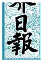
Logo of the Sekai Nippo

by the editorial department of the Sekai Nippo