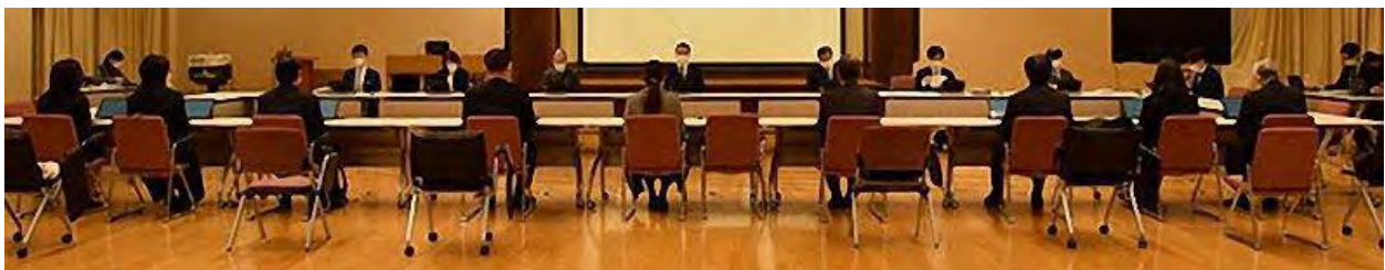
The 182nd meeting of the Religious Juridical Persons Council held in-person (some online Participation)

In the past, only Aum Shinrikyo and Myokakuji Temple have faced dissolution orders. Aum was involved in multiple homicides, and Myokakuji Temple was clearly engaged in fraud, making dissolution orders appropriate in those cases. However, it is doubtful whether the Family Federation warrants such action. The fact that such a significant change in interpretation can be made through a cabinet decision is a major problem, and ultimately, it is considered necessary to amend the law accordingly.