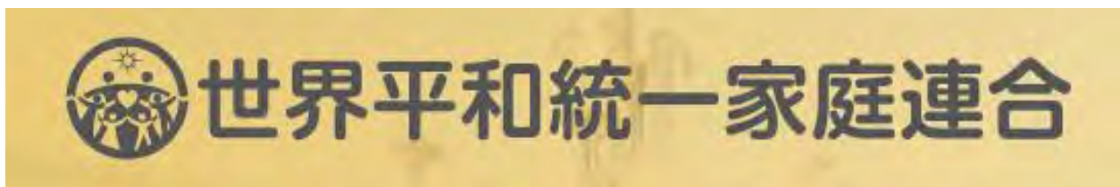
From the header of ffwpu.jp , the official homepage of the Family Federation of Japan.

Family Federation of Japan refusing to pay what it regards as unlawful fine