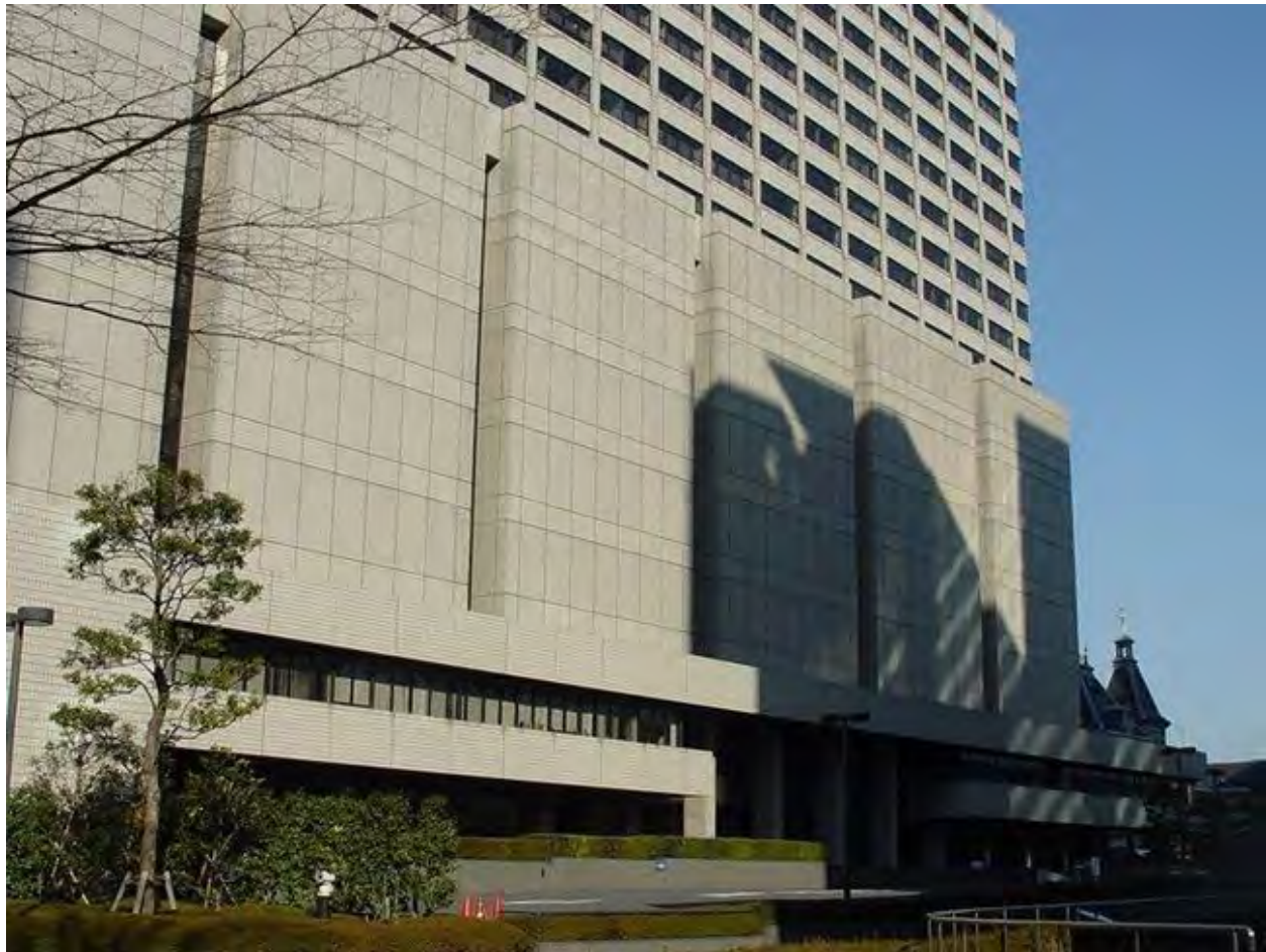
Public office building of Japan with Tokyo High Court and Tokyo District Court

Family Federation of Japan refusing to pay what it regards as unlawful fine