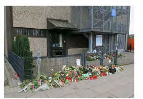
Kingdom Hall in Hamburg-Alsterdorf, ten days after the killing spree on 9th March 2023: damaged door, flowers