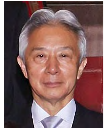
Masahito Moriyama, Minister of Education, Culture, Sports, Science and Technology (MEXT)

"In accordance with a relevant law, the hearing was held behind closed doors. Although the government has not disclosed what opinions it expressed, this is an important trial for freedom of religion. The progress of the trial and the evidence presented should be made public."