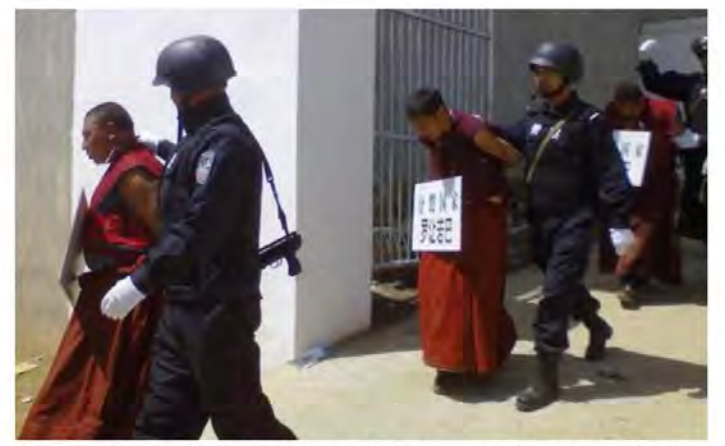
Persecution in China: Tibetan Monks arrested in 2008.

unusual in a democratic country that upholds freedom of religion. He points out that the current events in Japan are being highlighted in Chinese and Russian media as a form of propaganda, drawing parallels between Japan's actions and those of China in suppressing religious groups. Introvigne explains how the situation in Japan is being used for propaganda purposes by China and Russia ,