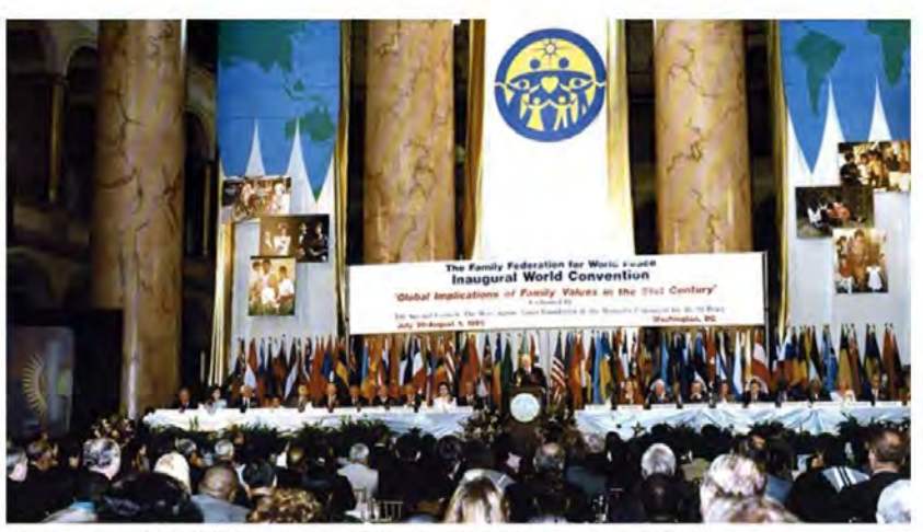
The Inaugural World Convention of the Family Federation 31st July 1996

As co-founder, Mother Moon gave the inaugural address titled "View of the Principle of the Providential History of Salvation", reading a prepared text. Father