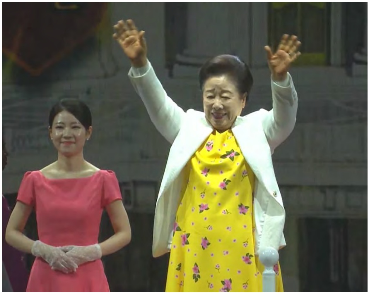
Mother Moon at the Marriage Blessing ceremony in South Korea 15th February 2024