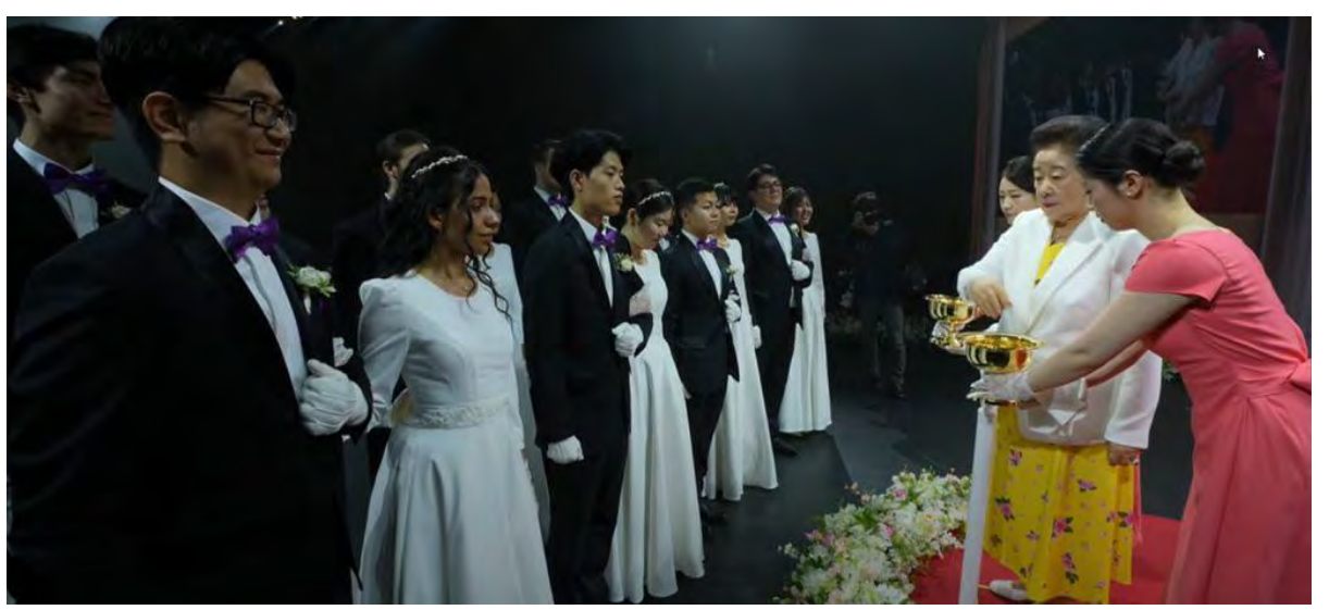
Mother Moon sprinkling holy water on representative couples 15th Feb. 2024

couples were on stage in two lines in front of <u>Hak Ja Han</u>. Attendants sprinkled the water on the other couples. <u>Mother Moon</u> then read the Affirmation of the <u>Blessing</u> Vow, to which everyone shouted a loud yes. Essentially, they promised to do all they could to be a loving and responsible spouse, establish a harmonious family, that would strive to build the kind of world that <u>God</u> originally envisioned, an ideal world where the family is the cornerstone.