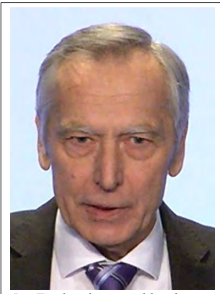
Jan Figel at the special luncheon 31st Jan. 2024 at the IRF Summit

Jan Figel, former European Union Special Envoy for Freedom of Religion or Belief, noted that the movement led by the Japanese Communist Party and leftist lawyers to dissolve the <u>Unification Church</u> has a "half-century history" and has now reached "a very dangerous stage." He warned, "Freedom of religion is the litmus test for all human rights. If this is not respected, freedom of speech, freedom of assembly and association will undoubtedly be restricted, suppressed, and violated."