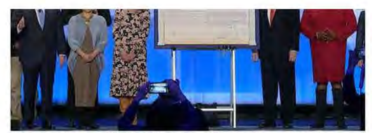
Some of the speakers at the special luncheon on 31st Jan. 2024 at the International Religious Freedom Summit in Washington DC.

Extract from a special pre-recorded message presented 31<sup>st</sup> January at the International Religious Freedom Summit 2024 in Washington DC, by senior American politician Newt Gingrich, former Speaker of the US House of Representatives. He delivered his presentation during a conference luncheon sponsored by The Washington Times Foundation and the Universal Peace Federation on the last day of the summit.