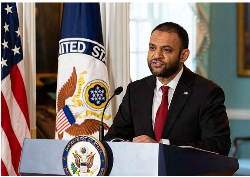
Rashad Hussain 15th May 2023

We have to make sure that the Japanese government understands that this is a key test of the future of Japan, a key test of the future of religious liberty.