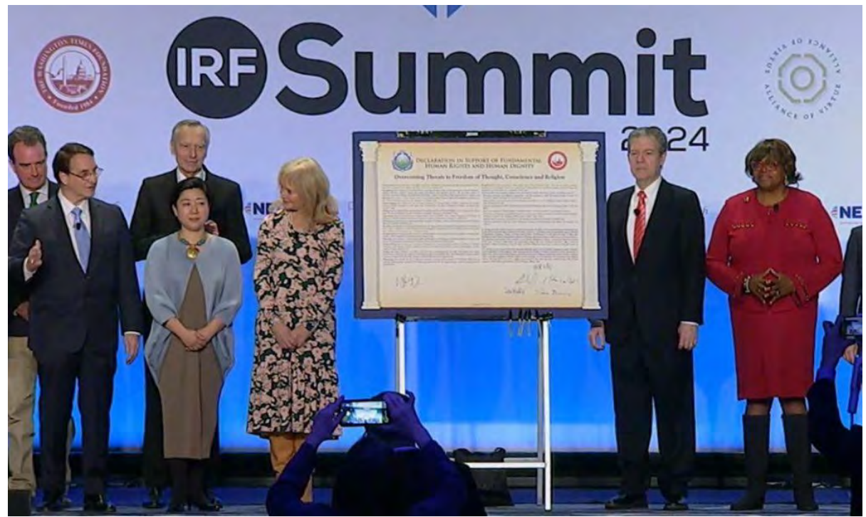
Some of the speakers at the special luncheon on 31st Jan. 2024 at the International Religious Freedom Summit in Washington DC

Former House Speaker shocked by Kishida administration being swayed by decades long vicious communist campaign