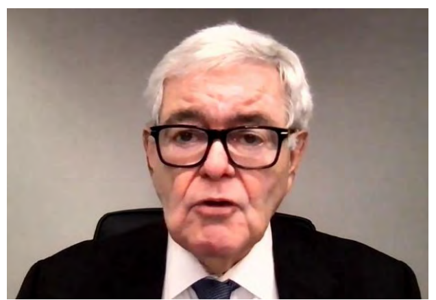
Newt Gingrich at the special luncheon 31st Jan. 2024 at the 4th International Religious Freedom Summit in Washington DC

Former House Speaker shocked by Kishida administration being swayed by decades long vicious communist campaign