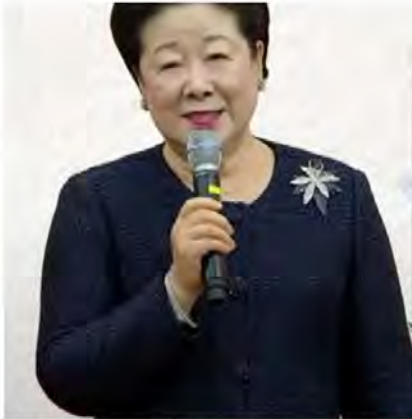
Mother Moon speaking.

repeatedly in her speeches over the last years, is the motherly heart of God. In order to understand the essence of God, and in fact, in order to create peace in the world, Mother Moon points out that we first need a more complete understanding of God. Traditionally, God has been understood as a Fatherly God, as seen in the opening words of the Lord's Prayer, "Our Father, Who art in heaven".