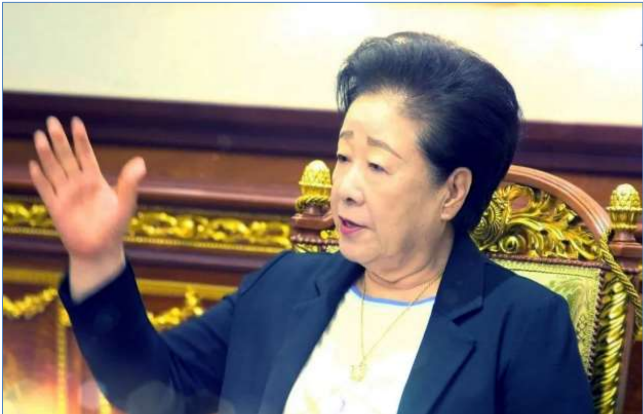
Holy Mother Han, here September 6, 2024 in Gapyeong , South Korea

In response to media hype, Family Federation says founder may be called only as a witness in politically charged probe ahead of Korean elections