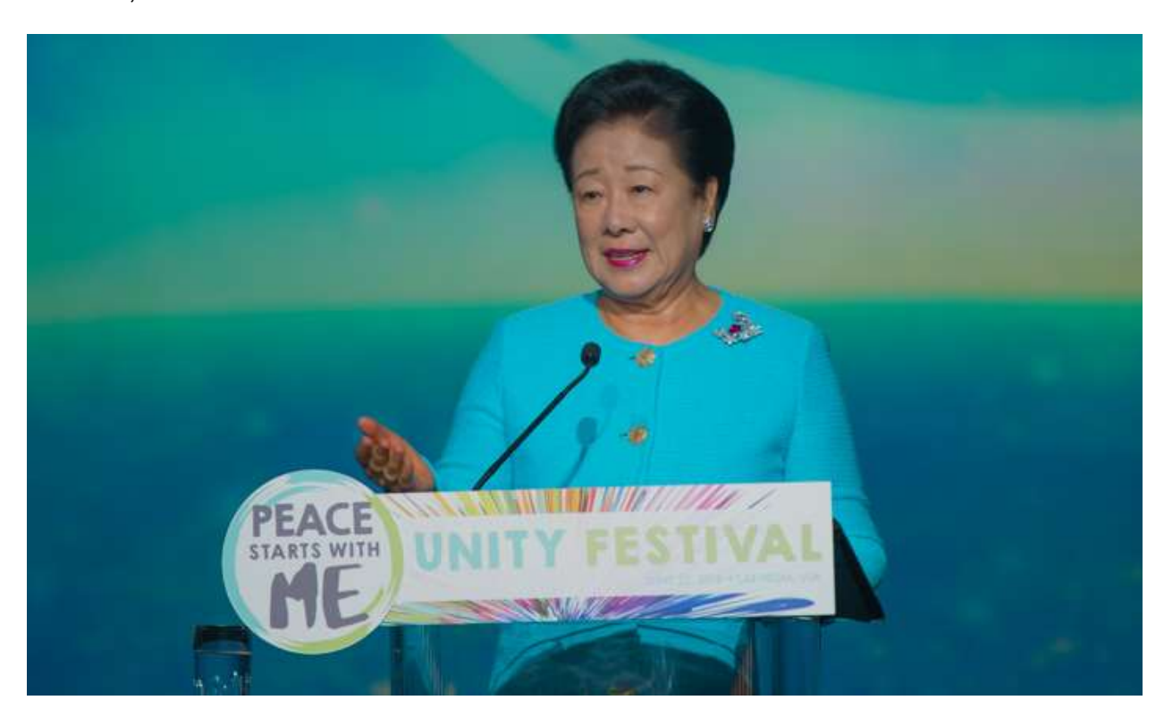
June 22 has finally arrived and the Peace Starts With Me Unity Festival lived up to its hype. Thousands of guests gathered in the Marquee Ballroom at the MGM Grand in Las Vegas to join together for peace.

This unity festival was a joint project of Family Federation for World Peace and Unification (FFWPU), an organization striving to establish peace and unity among all people, and the American Clergy Leadership Conference (ACLC), a coalition of faith leaders working beyond denomination to strengthen marriages and families.