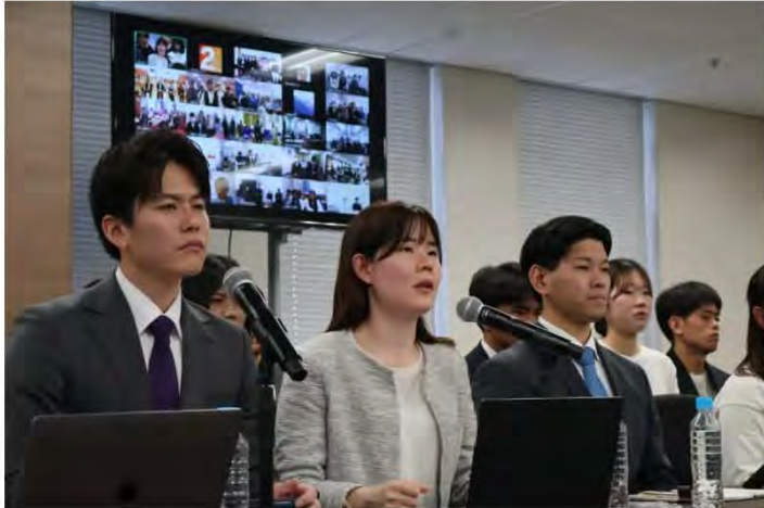
Representatives of the "Second Generation Association for Protecting the Human Rights of Believers [of the Unification Church]" speak following the Tokyo High Court's decision.