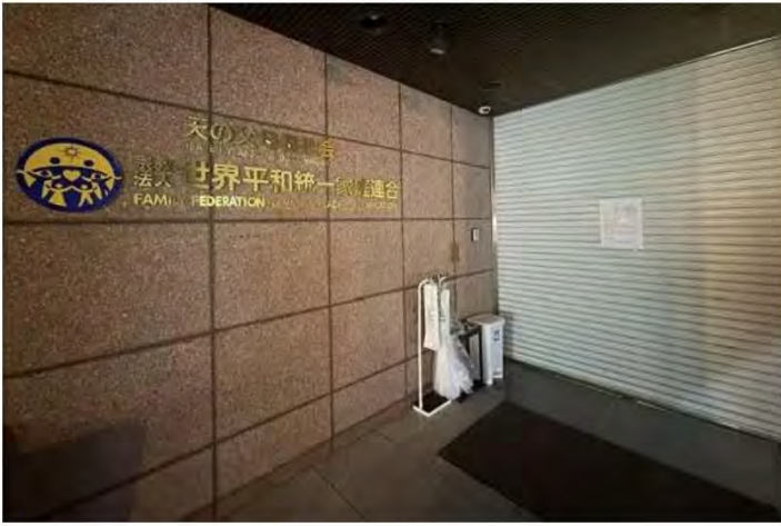
The Tokyo Family Federation headquarters were shut down by liquidators immediately after the verdict. Credits .

The High Court, in its hundreds of pages-long decision, answered their concerns in merely two pages, in the following way: