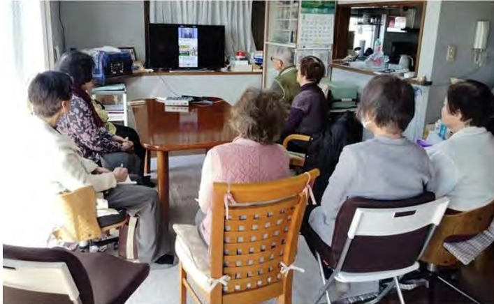
Japanese followers of the Family Federation gathering in a private home 8th March, on the first Sunday after the Tokyo High Court ruling on 4th March 2026.

by the editorial department of Sekai Nippo