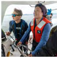
Learn to drive the boat!