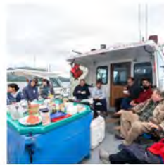
All-staff overnight trip!...