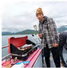
Grilling fresh caught sa...