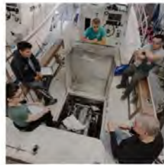
CIT's learning engine b...