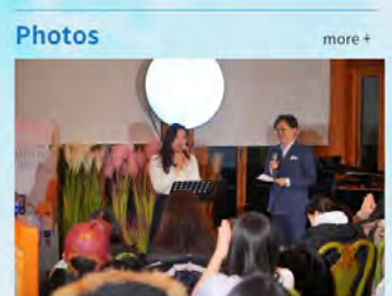
CheonBo Training Center