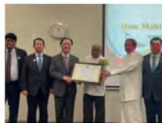
Asia Pacific UPF Conference at Sri Lankan Parliament Calls for Regional Cooperation