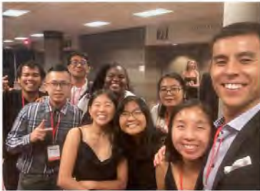
October 2, 2021 @ Shaquille O'Neal Foundation – The Event