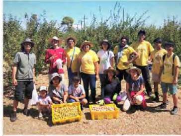
August 6, 2022 @ Ahern Orchard