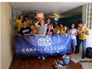
August 22, 2014 @ CARP Las Vegas House