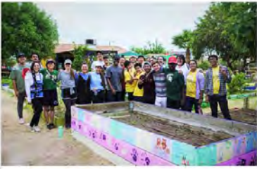
May 29, 2021 @ Vegas Roots Community Garden