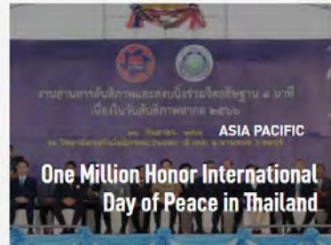
ASIA PACIFIC One Million Honor International Day of Peace in Thailand