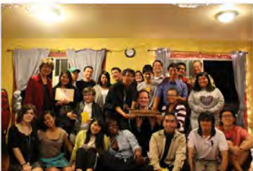
Shine City Project's 2nd Anniversary Celebration (March 14, 2015)