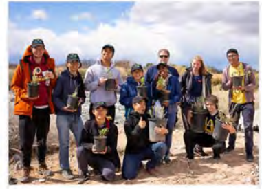
March 2, 2019 @ Las Vegas Wash