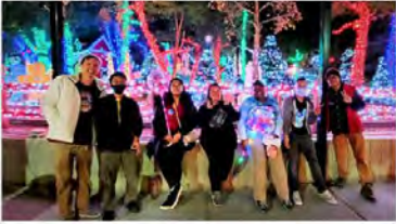
December 4, 2021 @ Opportunity Village – Magical Forest