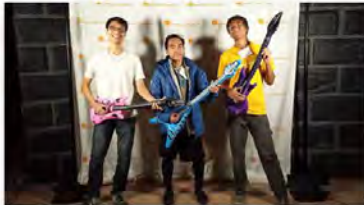
October 30, 2015 @ Haunted Harvest, Springs Preserve