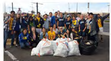
April 25, 2014 @ El Pollo Loco