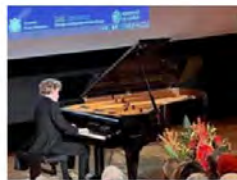
Europe & the Middle East Geneva Concert Honors the Memory of Nelson Mandela