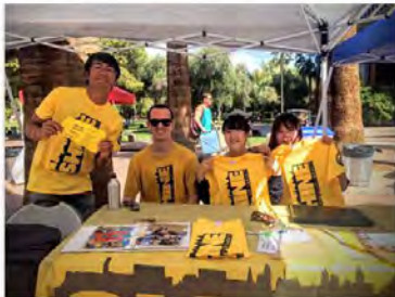
September 2, 2015 @ UNLV Involvement Fair