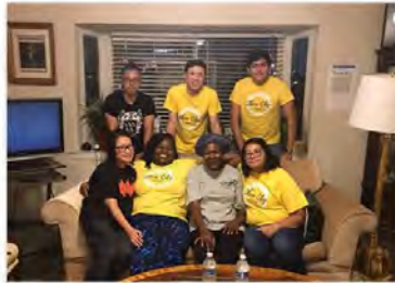
July 24, 2021 @ Harrison House