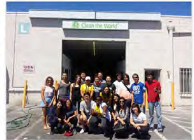
July 25, 2015 @ Clean the World