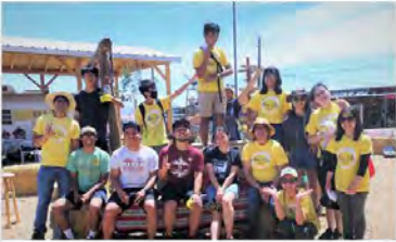
May 7, 2022 @ McKee Ranch Foundation