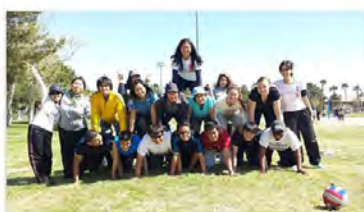
Shine City Project's 4th Anniversary