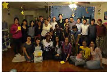
Shine City Project's 3rd Anniversary Celebration (March 18, 2016)