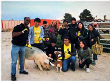
January 12, 2020 @ All Friends Animal Sanctuary