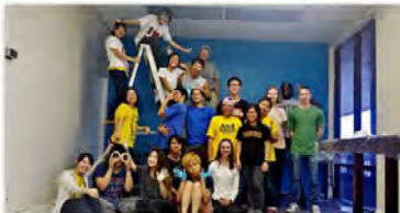
August 16, 2014 @ CARP Las Vegas Learning Center