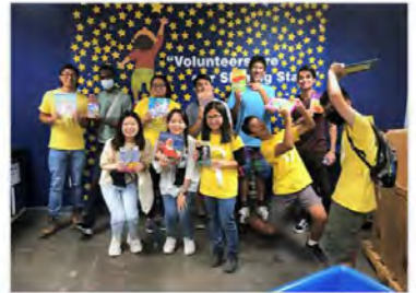
June 11, 2022 @ Spread the Word Nevada