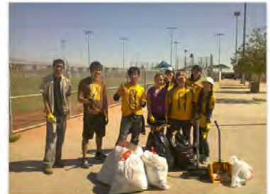
April 26, 2013 @ Lorenzi Park