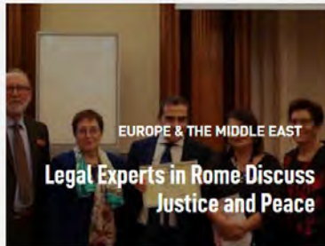
EUROPE & THE MIDDLE EAST Legal Experts in Rome Discuss Justice and Peace