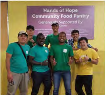
August 17, 2019 @ Catholic Charities of Southern Nevada with International Leadership Training Program (ILTP)