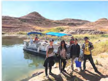
October 20, 2018 @ 33 Hole Overlook, Lake Mead