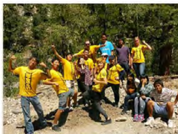
August 15, 2014 @ Mt. Charleston