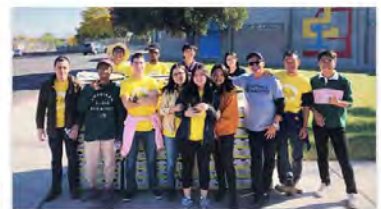
November 9, 2019 @ Just One Project – Helen Marie Smith Elementary School