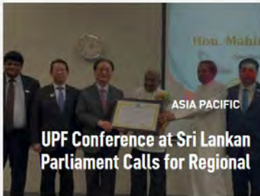
ASIA PACIFIC UPF Conference at Sri Lankan Parliament Calls for Regional Cooperation