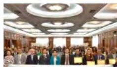
South America Pastors in Sao Paulo Appointed Ambassadors for Peace