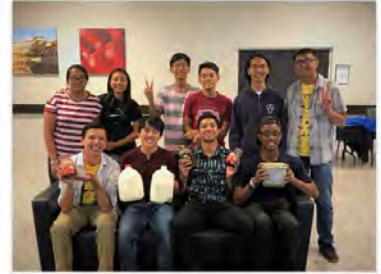
May 4, 2019 @ Club Christ Ladies Tea