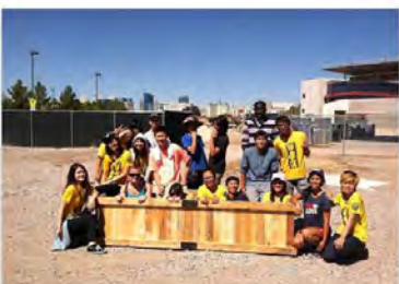
October 13, 2018 @ Las Vegas Wash with Generation Peace Academy