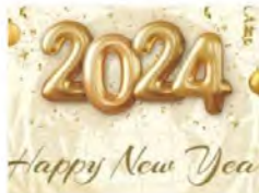
UPF International 2024 Happy New Year