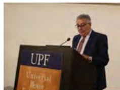
Asia Pacific Australian Citizens Awarded for Exemplary Community Service