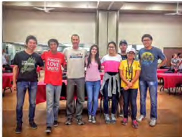
July 31, 2015 @ Las Vegas Rescue Mission