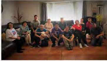
June 8, 2019 @ Silver Horizon Group Home