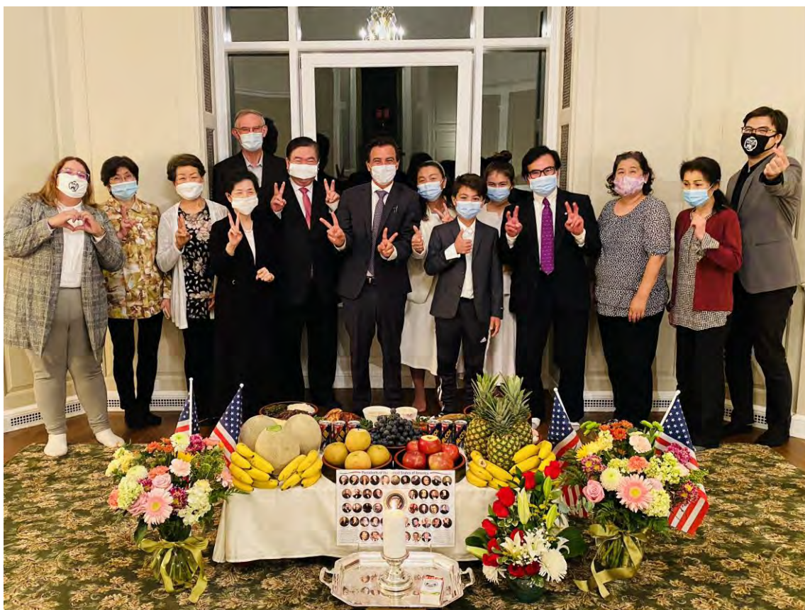
Chuseok 2020 celebration at Belvedere Estate FFWPU-USA

As blessed family members, let us pray our way through this time and root our actions in God's Will, for we are uniquely Chosen to do so.