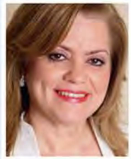
Hon. Emília Alfaro de Franco Former First Lady and Former Senator of the National Assembly of Paraguay.