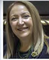
Hon. Dra. Silvia del Rosario Giacoppo National Senator of Argentina