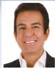
Salvador Alejandro César Nasralla Salum

President and Executive Editor of The Washington Times.