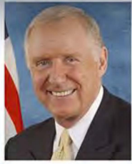
Hon. Dan Burton U.S. House of Representatives (1983-2013); Co-Chairman, International Association of Parliamentarians for Peace of UPF.