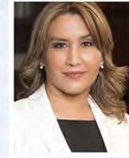
Madam Hilda Patricia Marroquín de Morales Former First Lady of the Republic of Guatemala 2016-2020.