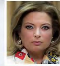
Hon. María Fernanda Flores de Alemán Former First Lady of Nicaragua; actually she is Congresswoman of the National Assembly of Nicaragua.