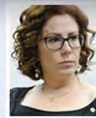
Hon. Carla Zambelli Salgado Member of the National Congress of Brazil