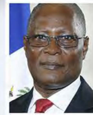
H.E. Jocelerne Privete Former President of Haiti (2016 -2017). He was President of the Senate in Economy and Finance.