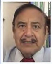
Hon. Elmer Evangelista Sánchez Former Senator of the Republic of Peru and Former Bicameral Budget President.