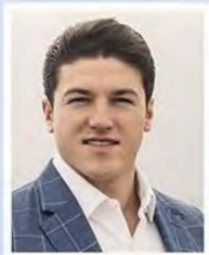
Hon. Dr. Samuel Alejandro García Sepúlveda Senator elected by a relative majority in the state of Nuevo Leon, México.