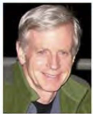
Hon. David Kilgour Was first elected to the Canadian House of Commons in 1979 and was re-elected seven times. International Council.