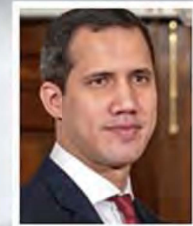
H.E. Juan Guaidó Current president of the National Assembly and interim president of Venezuela.