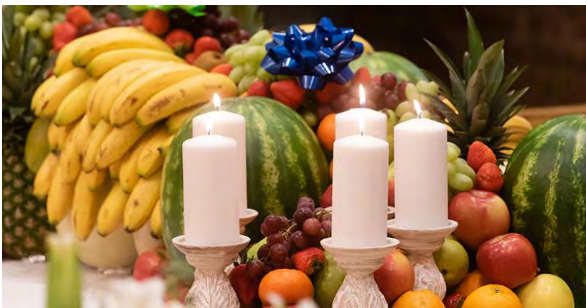
Photo: Offering table at East Garden estate where USA leaders joined the broadcast

On September 4 in Korea, a live online broadcast of True Parents' Centenary and 60th Holy Wedding Anniversary was shared with hundreds of thousands of people from all over the world linked together virtually. True Parents is an affectionate term for Rev. Dr. Sun Myung Moon and his wife Dr. Hak Ja Han Moon. The event, an enormous online endeavor, aired from the Hyojeong Cheonwon in South Korea and also featured a Cheonbo festival commemorating the 8th anniversary of Rev. Moon's ascension to the spirit world.