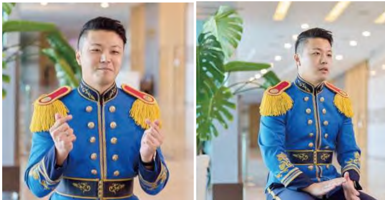
Interview with UPA Youth Envoy Yoshiyuki Shikanai