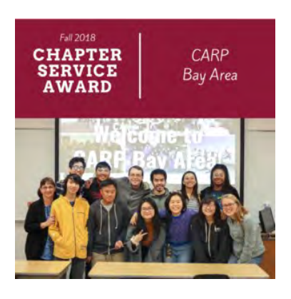
CARP Bay Area consistently participates in community service and takes every volunteering opportunity.