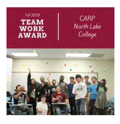
CARP North Lake put their heads together for a fun, experiential program to learn and apply the new CARP