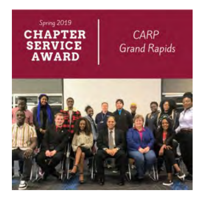
CARP Grand Rapids serves their campus by sharing their culture with every member of their campus community.