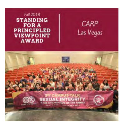
CARP Las Vegas challenged the campus hook-up culture with the counter-proposal of sexual integrity, in their third Campus Talk, inviting professors and other clubs to join in.