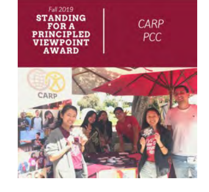
CARP PCC hosted two weekend retreats this semester and worked more closely with their mentors and advisors to have effective meetings and support their members.