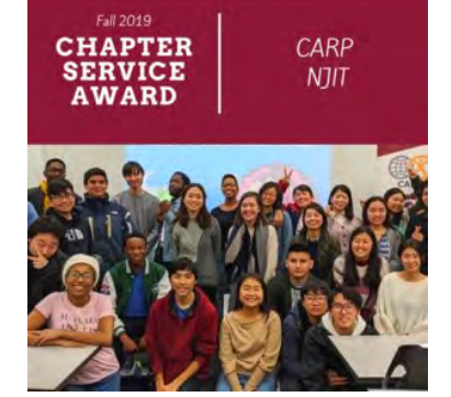
CARP NJ hosted weekly meetings and volunteered in service projects and by visiting local churches with a message of peace. They also hosted a campus event.