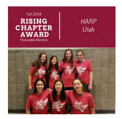
HARP Utah started this semester with two sisters who've invited their friends to participate and share in CARP's culture.