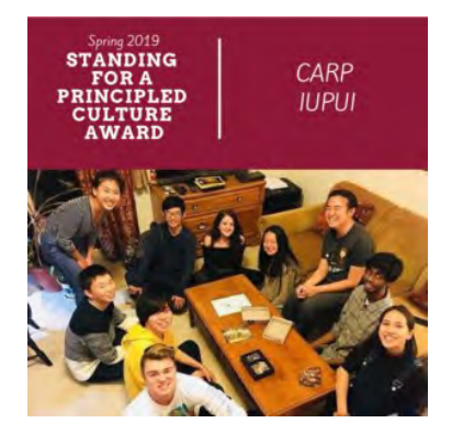
CARP IUPUI has a warm and welcoming environment to join and talk about what matters, no matter what background.