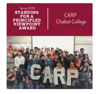
CARP Chabot stands for the peace perspective, even in the face of opposition, leading to an amazing campus event.