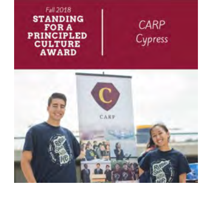
The CARP Cypress team is a powerhouse of love and care for their campus in spite of the challenges. They also hosted a campus event to bring faculty and students together.