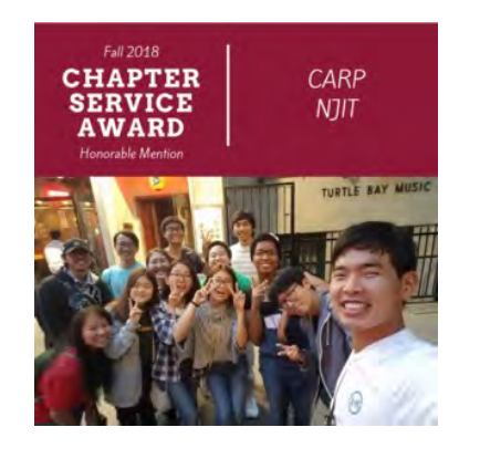
CARP NJIT spent every weekend volunteering in spite of busy school schedules.