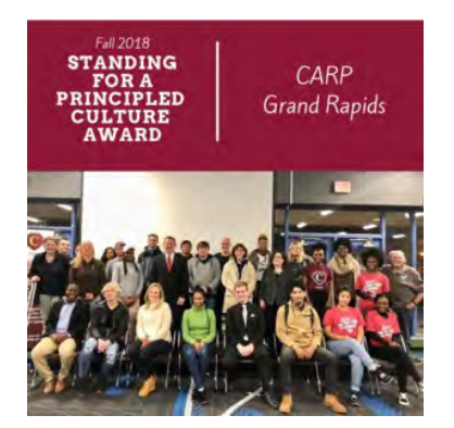
Not only did CARP Grand Rapids host a campus event promoting peace, every meeting and activity is embedded with a family culture.