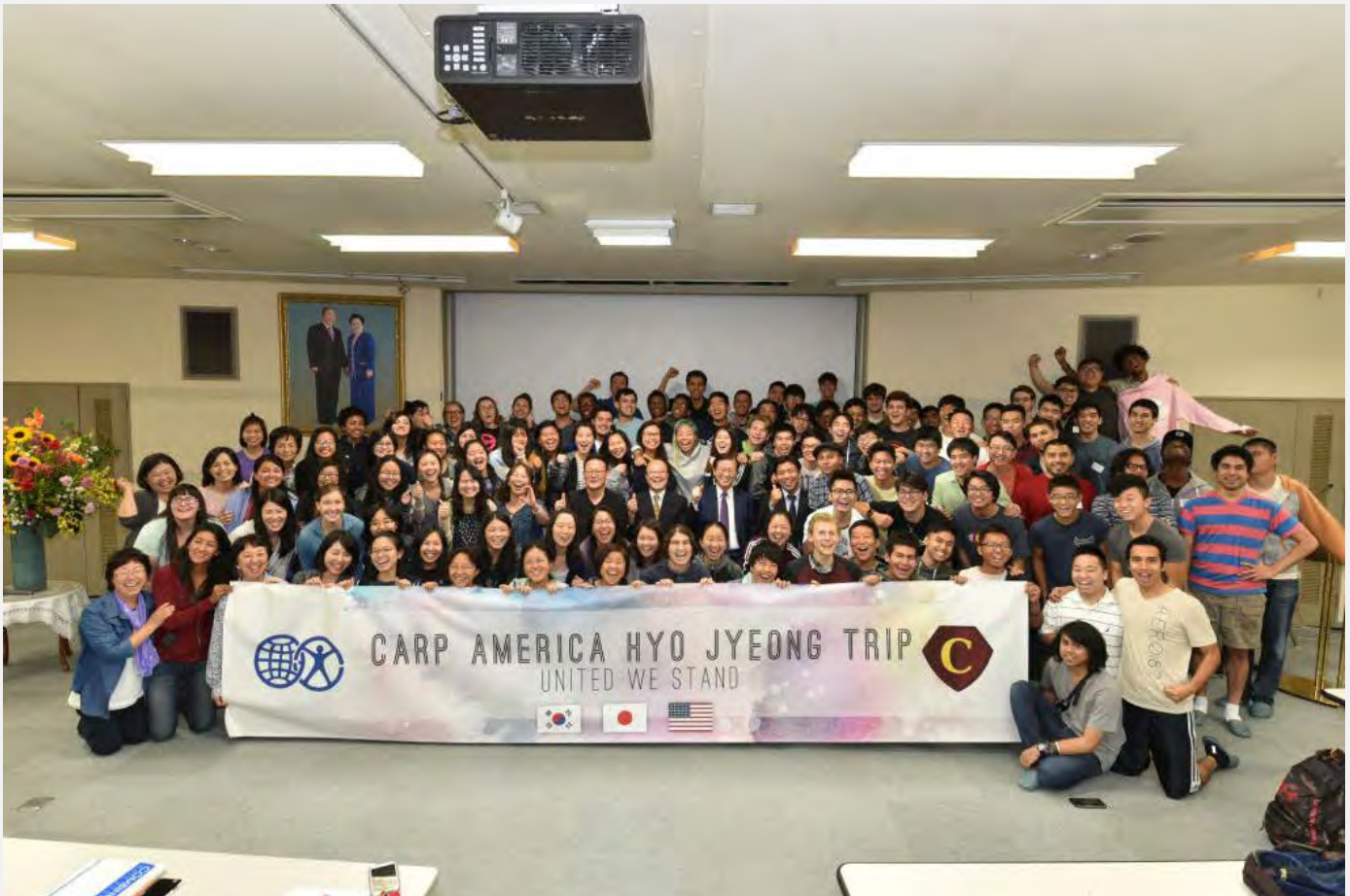
Welcome to the 3rd Annual HyoJeong Trip!