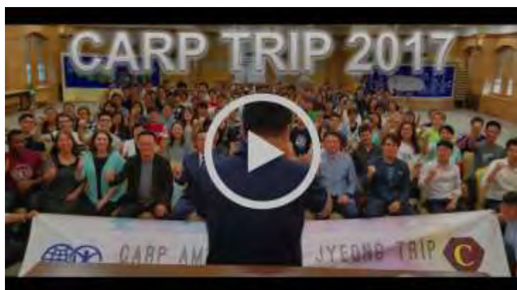
2017 HyoJeong Trip Video

On the success of the past two years of the CARP HyoJeong trip, the 2018 HyonJeong trip is being planned and is open for registration and donations. Here is some information and a video from their site: