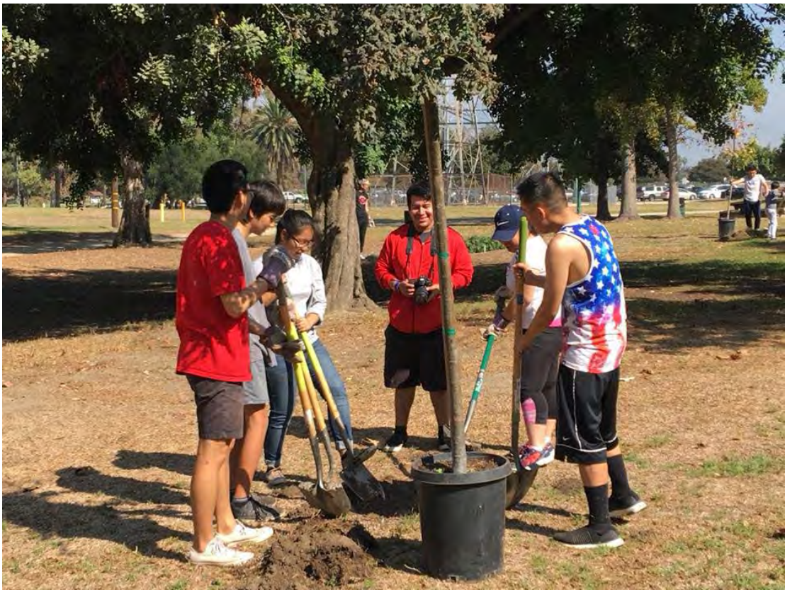
CARP PCC plants trees on a Saturday for community service.

And a new chapter was officially registered as a student club on campus , joining the movement of young people changing the conversation on campus.