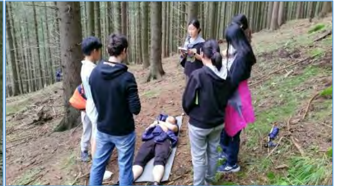
HwaDongHae : Day of Unity and Harmony!