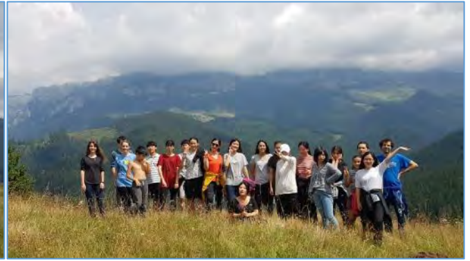
Action Task : Experience of SungHwa Ceremony