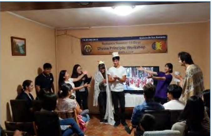
Action Task : Blind walking and finding a message from God!