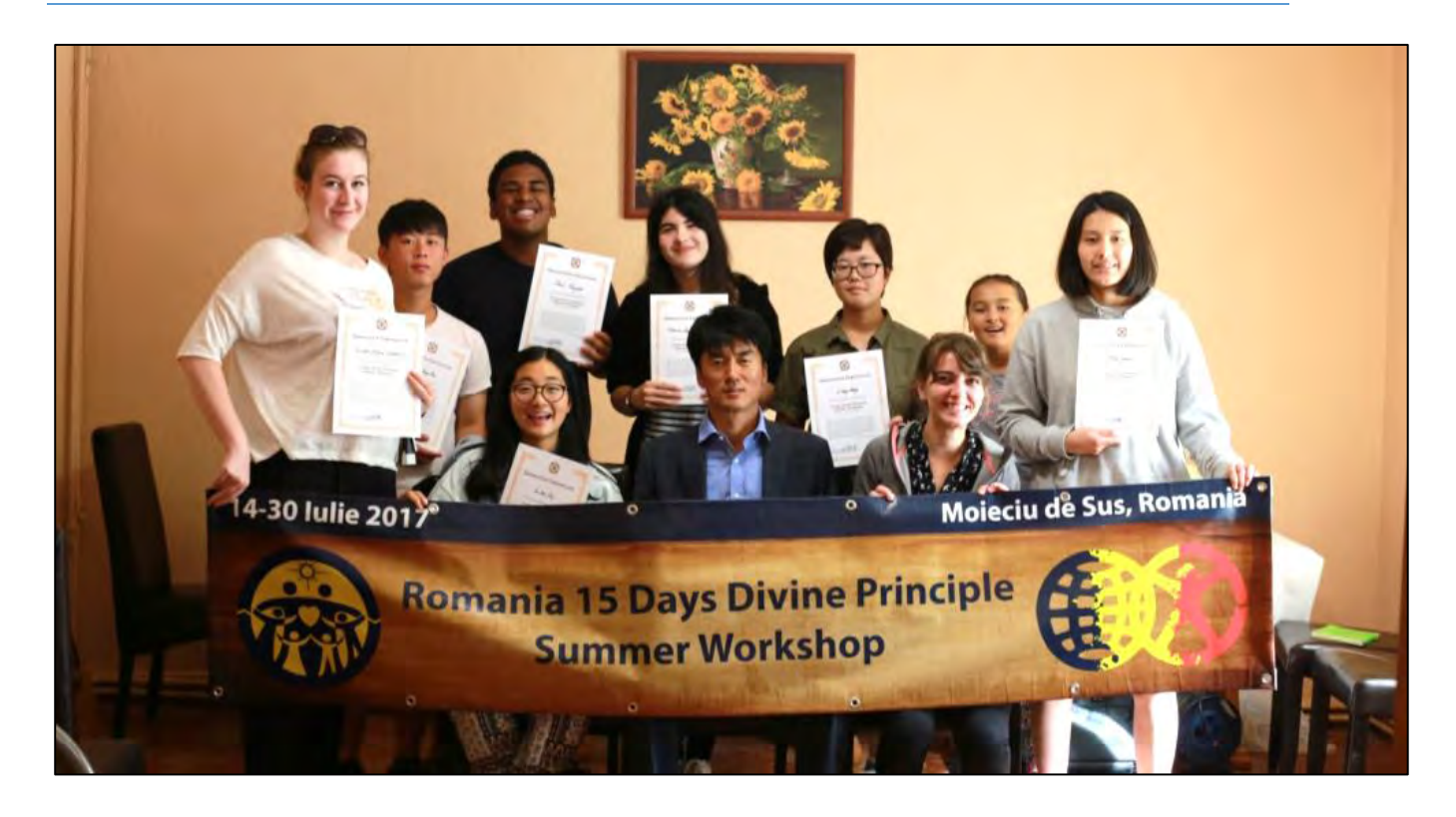
Fabulous ChamSengMyeong! And the cutest smiles 😕