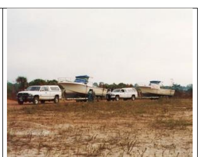
The two Good Go TE283 boats, representing Heavenly Fortune, arrived in Jardim in December 1997