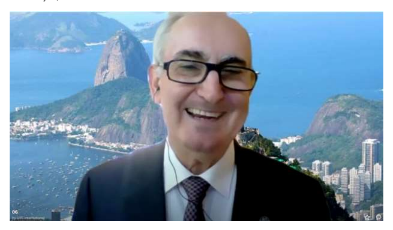
Brazil -- On February 6, 2021, the International Association for Peace and Development (IAPD-Brazil) held the program "World Interfaith Harmony Week: Building Bridges Beyond the Frontiers, with the aim of solidifying a unified world of peace under the tutelage of God, our Creator, regardless of one's religion. To watch the entire program, <u>click here</u>.

World Interfaith Harmony Week was proclaimed by the UN General Assembly and adopted on October 20, 2010. In the resolution, the General Assembly emphasizes that mutual understanding and interreligious dialogue are important dimensions of a culture of peace. The resolution established the first week in Feburary as World Interfaith Harmony Week as a way to promote harmony among all people. In reference to this date, we invited religious leaders to participate in the event to share words and views from different denominations, held online by the Zoom, Youtube, and Facebook platforms and broadcast by the Global News TV channel. The event was attended by 2,225 people through social networks, in addition to the audience of TV Global News.