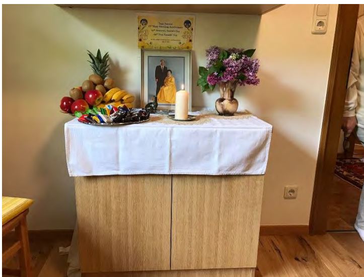
Holy Day in Lienz, East Tyrol