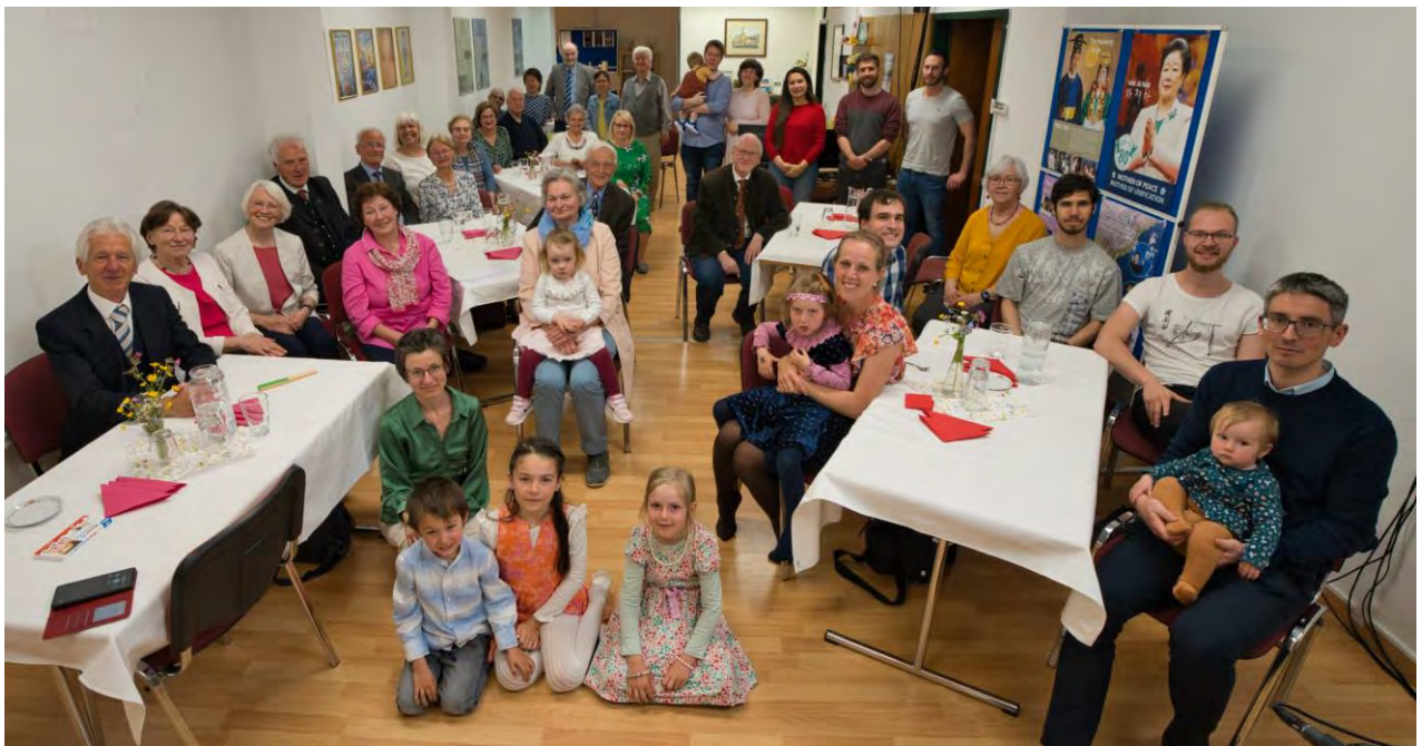
Holy Day celebration in Linz, Upper Austria