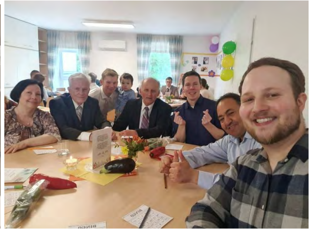
Holy Day in Graz, Styria