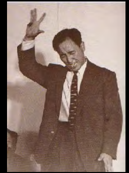
3 rd Adam

I have been conducting the program of the spirit world for everything.