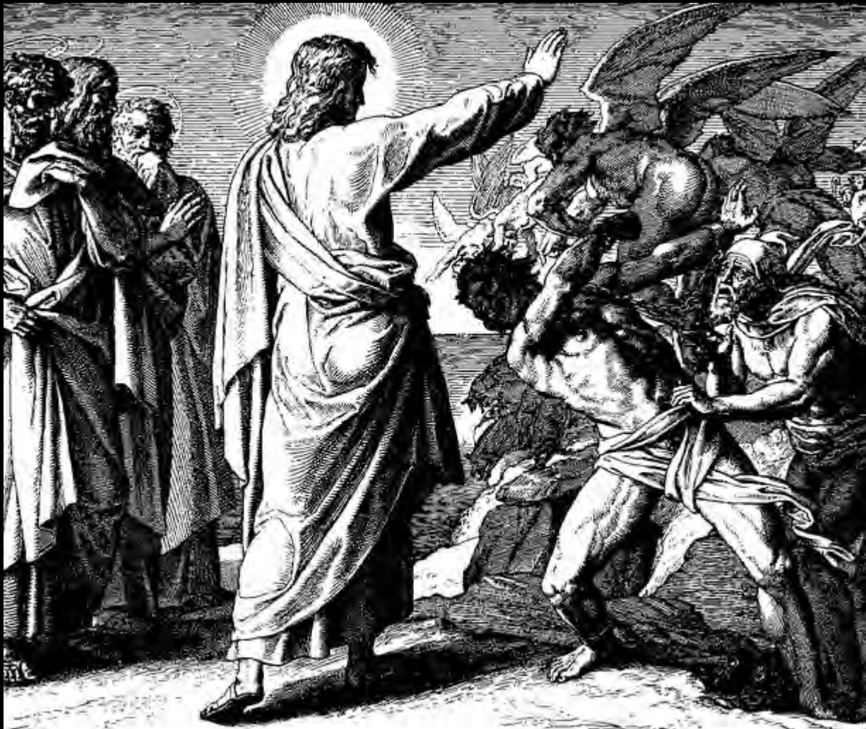
Jesus casting out demons! Exorcism