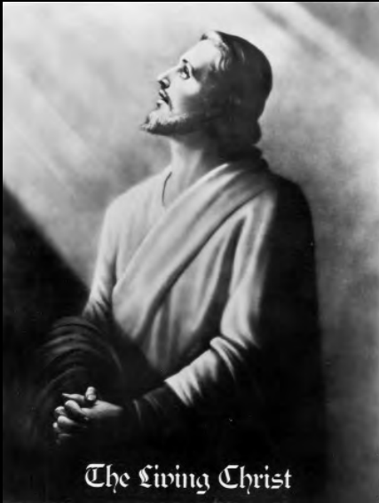
The Living Christ