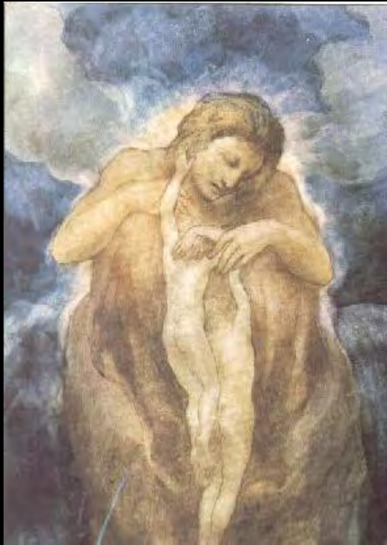
Angel of hope by Kahlil Gibran