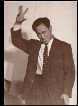
3 rd Adam

So far, there have been many, many evil spiritual phenomena. There are many evil, lost spirits haunting people.