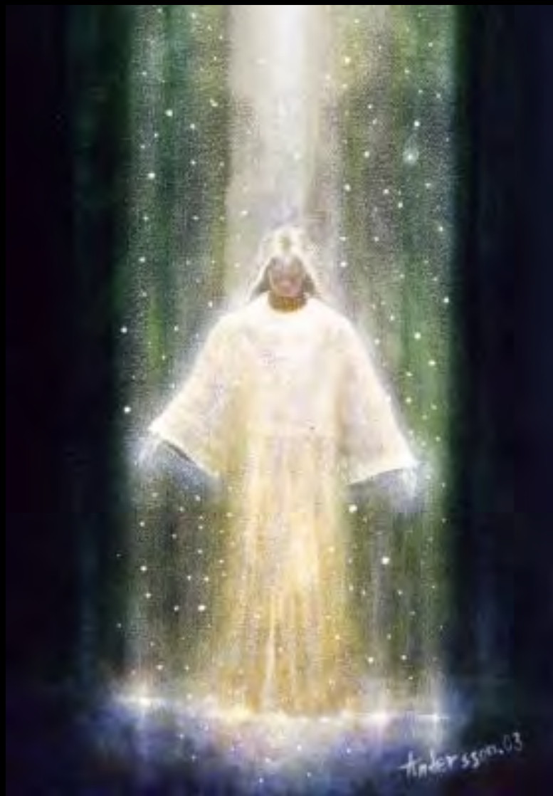
Recense of an Angel Artist Benny Andersson