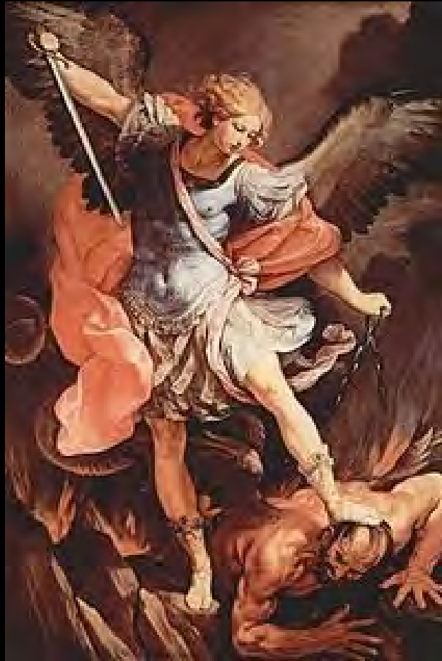
The Archangel Michael wears a late Roman military cloak and cuirass in this 17th century depiction by Guido Reni