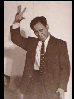
3 rd Adam

Do you think that I simply listen to the words of some women or grandmothers, or some spiritual medium? No way. They are ignorant.