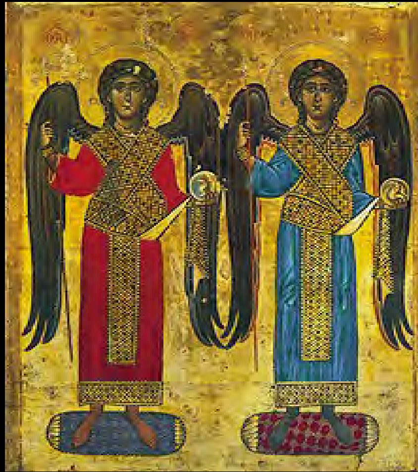
Orthodox icon from Saint Catherine's Monastery, representing the archangels Michael and Gabriel. Along with Rafael counted as archangels of Jews, Christians and Muslims.