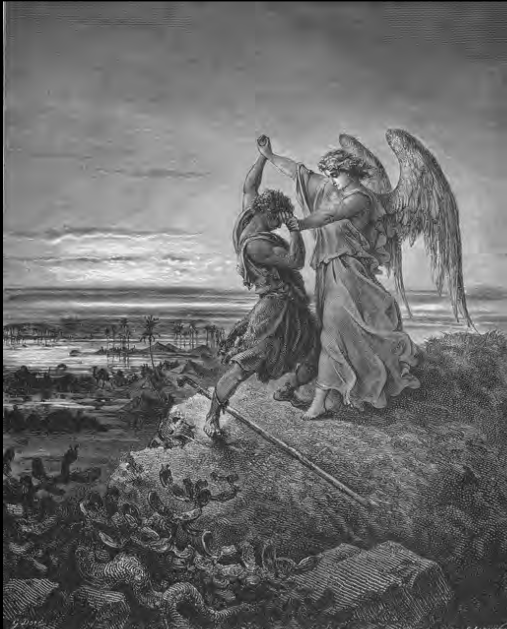
Jacob & The Angel