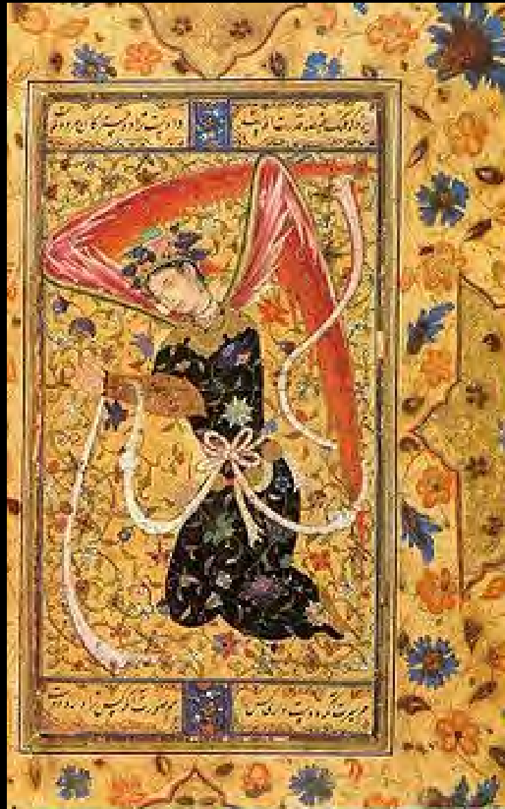
Depiction of an angel in Islamic Persian miniature