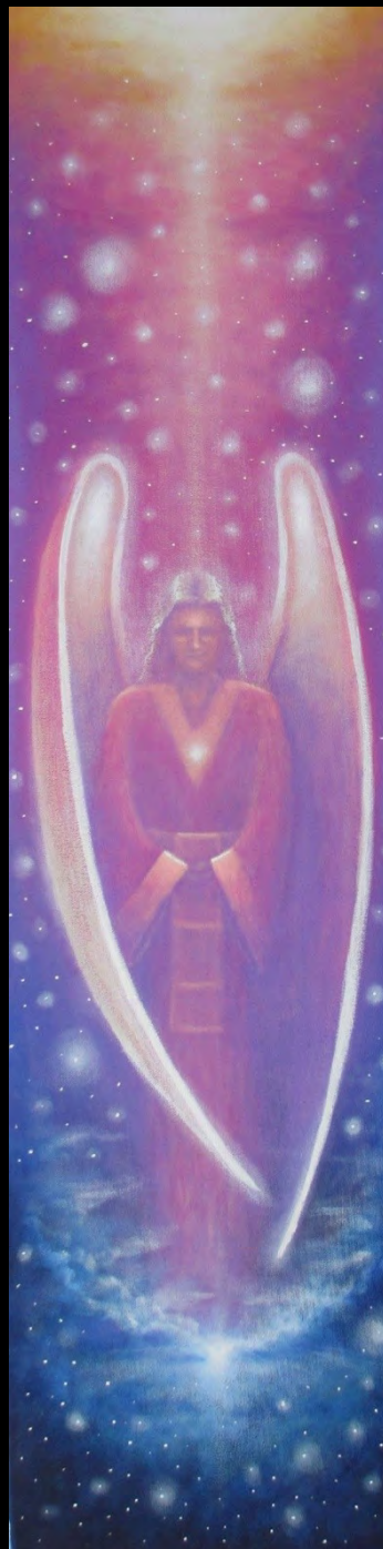
Artist Benny Andersson Sweden