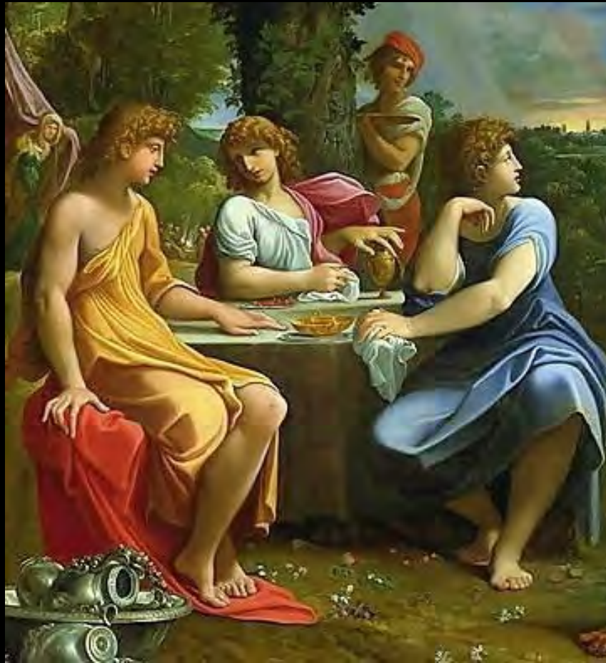
Three angels hosted by Abraham, Ludovico Carracci (1555–1619), Bologna, Pinacoteca Nazionale.