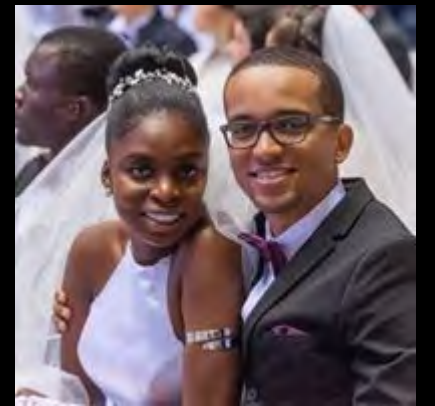
Holy Blessing 2018 Korea