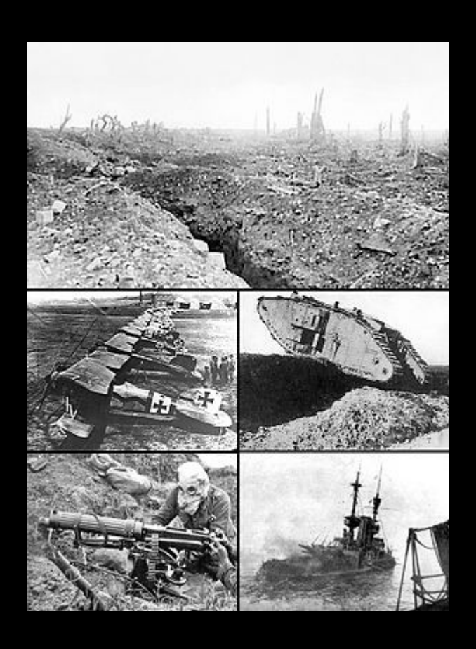
During 1st WW